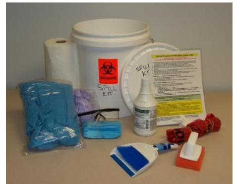
Here is an example of an assembled kit using a bucket to store the kit contents. The bucket can be lined with the biohazard bag for collection of spill waste.