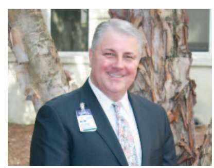
The DNP Advantage 10 Doctor of Nursing Practice degrees help leaders gain knowledge and responsibility