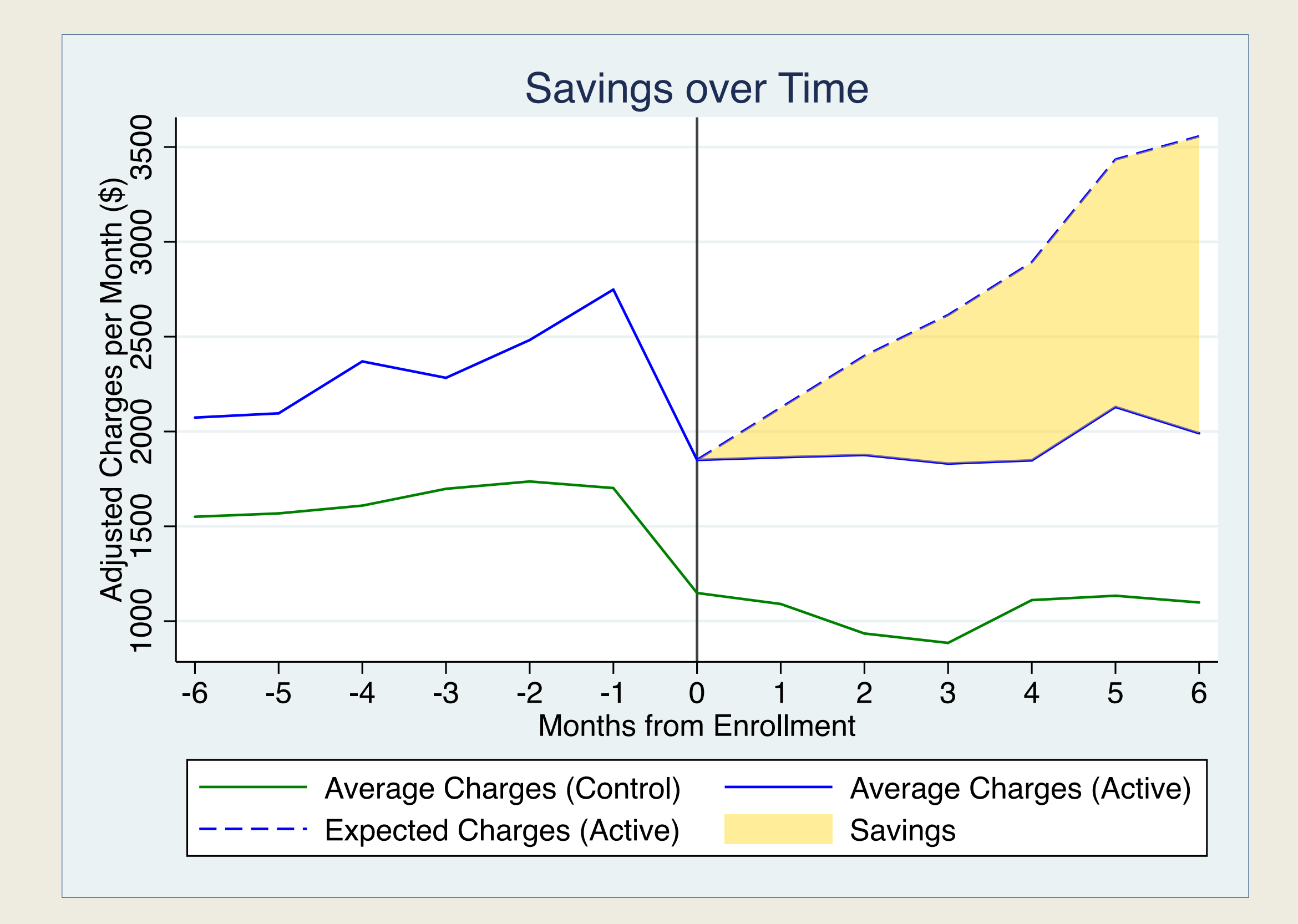
Chart 1. Graphical representation of our ROI model

Figures 2 & 3. Workshopping metrics for an external client report