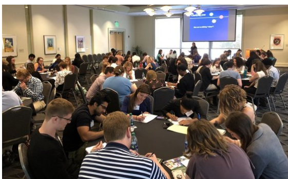
Graduate Student Career Exploration Workshop, 2019 Career Symposium