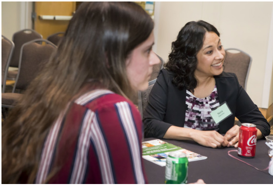
Networking Huddles, 2019 Annual Career Symposium

weeks at the National Academies of Sciences, Engineering, and Medicine in Washington DC learning about science and technology policy and the role that scientists and engineers play in advising the nation. This is a great fellowship opportunity, and if you are interested in applying, let BRET Career Development know and we can connect you with fellowship alumni who can give insight on the application process.