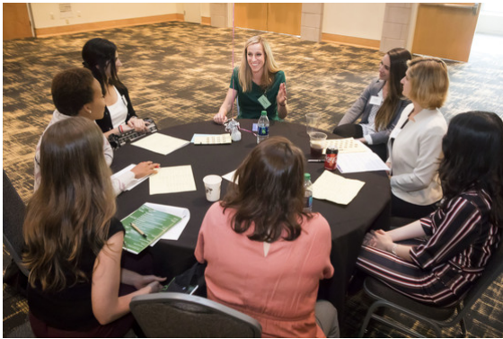
Networking Huddles, 2019 Annual Career Symposium

weeks at the National Academies of Sciences, Engineering, and Medicine in Washington DC learning about science and technology policy and the role that scientists and engineers play in advising the nation. This is a great fellowship opportunity, and if you are interested in applying, let BRET Career Development know and we can connect you with fellowship alumni who can give insight on the application process.