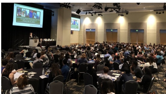
Morning Plenary Sessions, 2019 Career Symposium