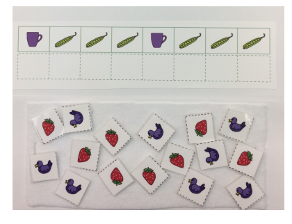
"Can you make the same kind of pattern using your pictures?" [Experimenter gestures to boxes below the model pattern.]