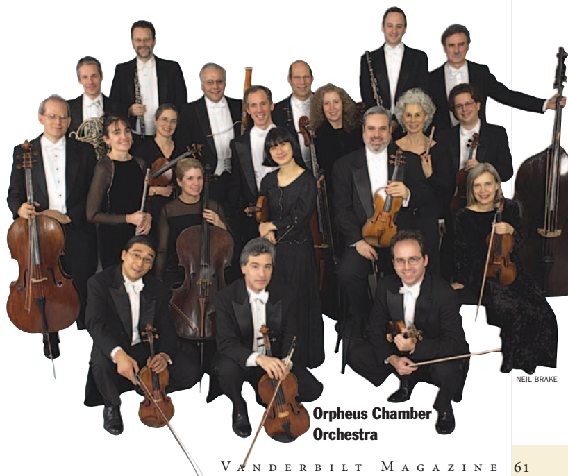
Orpheus Chamber Orchestra