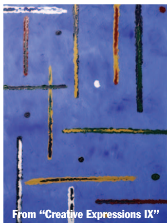
From “Creative Expressions IX”

“ Creative Expressions IX ,” on view at the John F. Kennedy Center for Research on