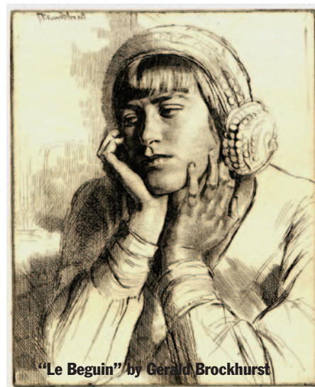
“Le Beguin” by Gerald Brockhurst

mounted two exhibits this fall that showcased the beauty of line found in etchings and aquatints.