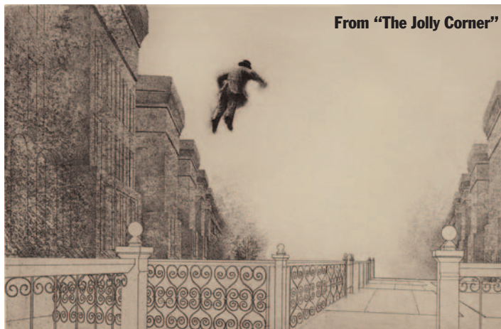
From “The Jolly Corner”