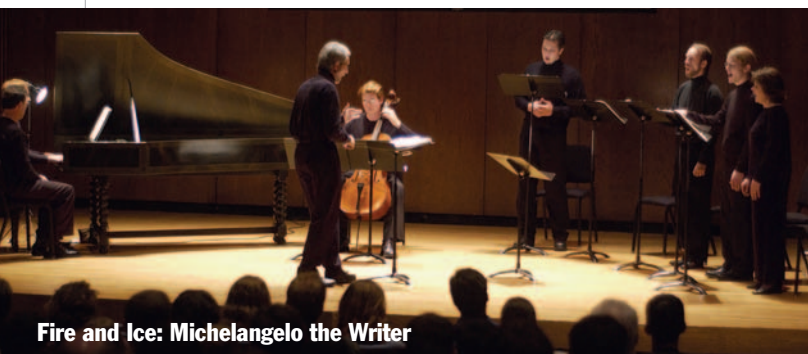
Fire and Ice: Michelangelo the Writer

On April 18 in Langford, the colorful, inventive and sometimes controversial dance group known as Brian Brooks Moving Company took center