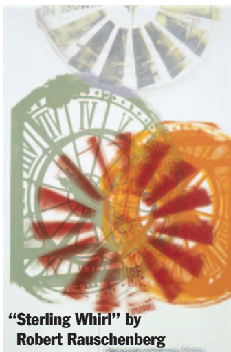
“Sterling Whirl” by Robert Rauschenberg

“Collectively, [muckraking journalism] issues a wake-up