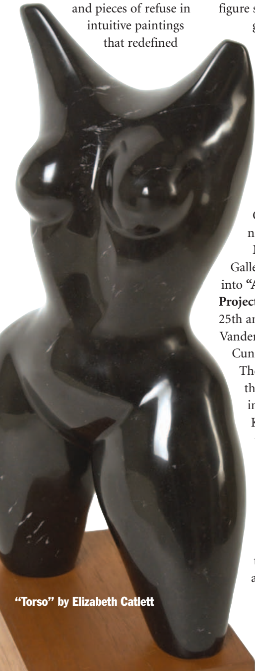
“Torso” by Elizabeth Catlett