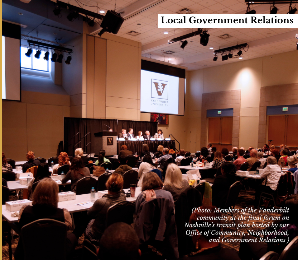
(Photo: Members of the Vanderbilt community at the final forum on Nashville's transit plan hosted by our Office of Community, Neighborhood, and Government Relations)

As a part of the Division of Public Affairs, the Office of Community, Neighborhood, and Government Relations (CNGR) works daily with Metro Government of Nashville and Davidson County and oversees a broad range of issues and regulations impacting Vanderbilt.