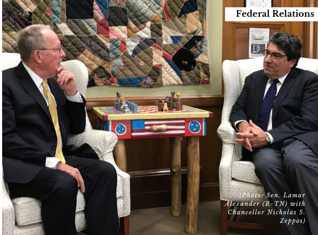
(Photo: Sen. Lamar Alexander (R-TN) with Chancellor Nicholas S. Zeppos)

The Office of Federal Relations (OFR) continues to play an integral and valued role in shaping federal public policy and successfully advocating for the university's federal priorities with lawmakers.