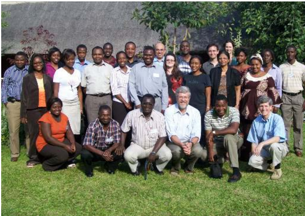
Vanderbilt faculty and UNZA students

For more information, visit http://www.unza.zm .