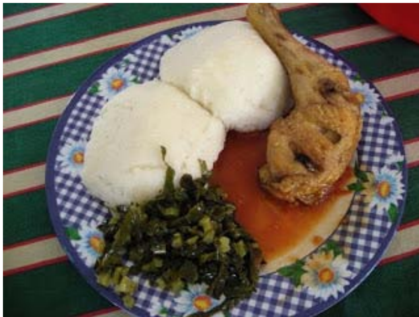
A typical Zambian meal: nshima, rape, and chicken

Alcohol: many local lagers are available and relatively cheap (Mosi Lager is the most popular); all wines are imported and a bit more expensive