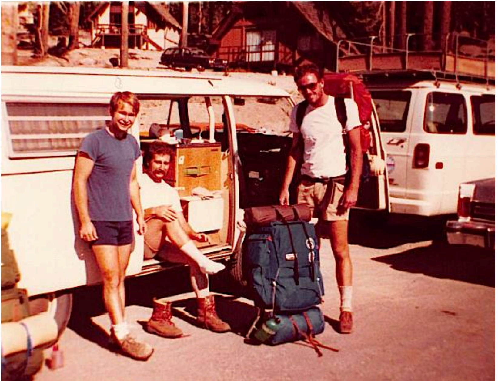
Two current Vanderbilt professors are in this picture