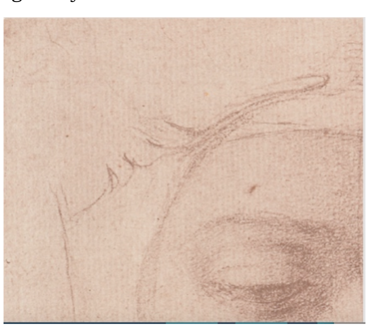
Windsor drawing (cropped; wing enlarged)

wing backwards, with the longer of its feathers (known anatomically primaries) lying above the figure's right eyebrow, while somewhat shorter feathers (known as secondaries) recede to lie above the ear? (Tips of the primary feathers from a presumed similar wing on the helmet's left side are visible above the just figure's left eyebrow.)