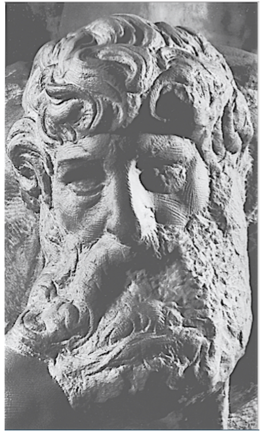
The Victory (lower figure)

But in the end, the eyes seem to have it once again. The crouched, trapped older man is blind - or rather, has been blinded - at least in his left eye; it is a grotesque thing to look at.