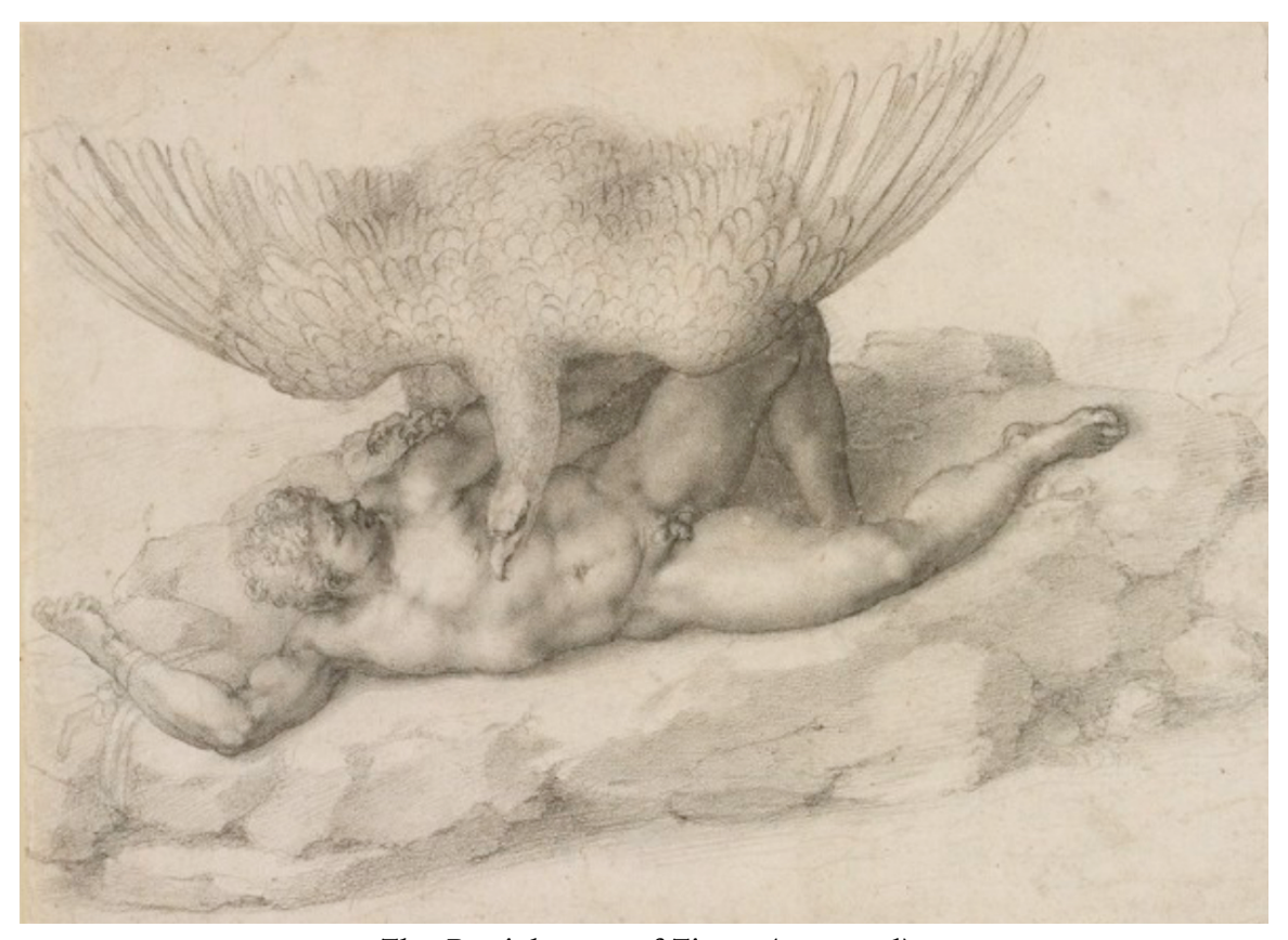
The Punishment of Tityos (cropped)

Nor would this be Michelangelo's only winged visual association to Tommaso. Of the extraordinary gift (or, traditionally, "presentation") drawings in red chalk done for the young Roman and sent to him in Rome via others, several - indeed most - of them feature impressive depictions of wings: the now lost (apparently) Rape of Ganymede , known to us today in copies by others; the Fall of Phaeton ; The Dream . But in graphic art, arguably the ne plus ultra depiction of a bird's extended wings - an image frightening in its splendor - is that found in the magnificent The Punishment of Tityos .