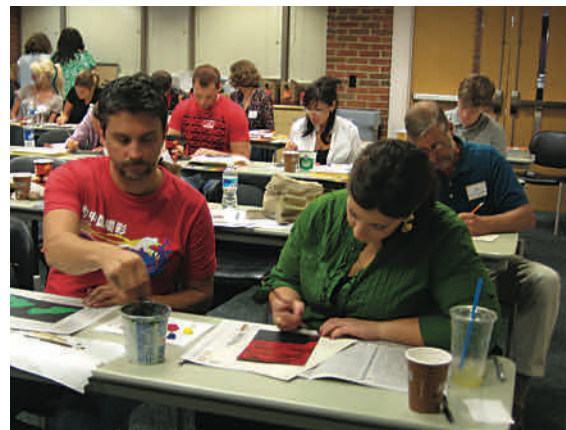
Photo above, retablo by a Hillsboro High student; photo far left, Hillsboro High students make retablos; photo, near left, teacher workshop at Vanderbilt.