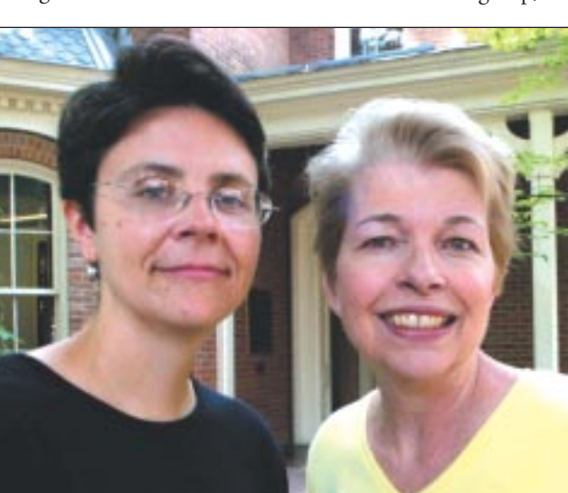
n's the upcoming program's implica-

tions for continued scholarly inquiry into women's strategic agency and how that scholarship may affect contemporary views of gender relations in the broader cultural arena.