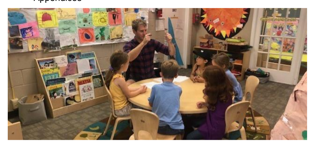
VCFC has designed this handbook to inform families of the Owls Developmental Kindergarten Program policies and procedures.