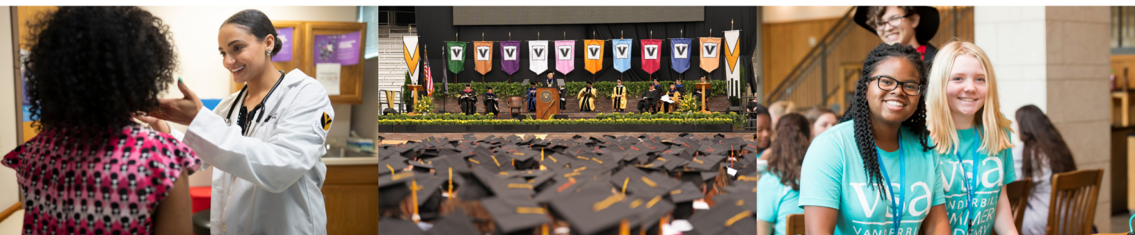
Left to right: Nursing student training; Vanderbilt commencement; Vanderbilt Summer Academy participants

For more information, please contact Vanderbilt University's Office of Federal Relations: federalrelations@vanderbilt.edu