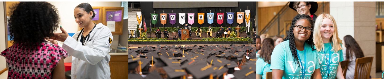
Left to right: Nursing student training; Vanderbilt commencement; Vanderbilt Summer Academy participants

Note: Data associated with a zip code represented by multiple districts is counted once for each district. Vanderbilt University's FY 2024 runs July 1, 2023–June 30, 2024. This data was compiled by the Division of Government and Community Relations in partnership with the Office of Data and Strategic Analytics.