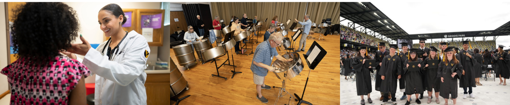
Left to right: Nursing student training; Osher Lifelong Learning Institute steel drum class; Next Steps graduation

Note: Data associated with a zip code represented by multiple districts is counted once for each district. Vanderbilt University's FY 2024 runs July 1, 2023–June 30, 2024. This data was compiled by the Division of Government and Community Relations in partnership with the Office of Data and Strategic Analytics.