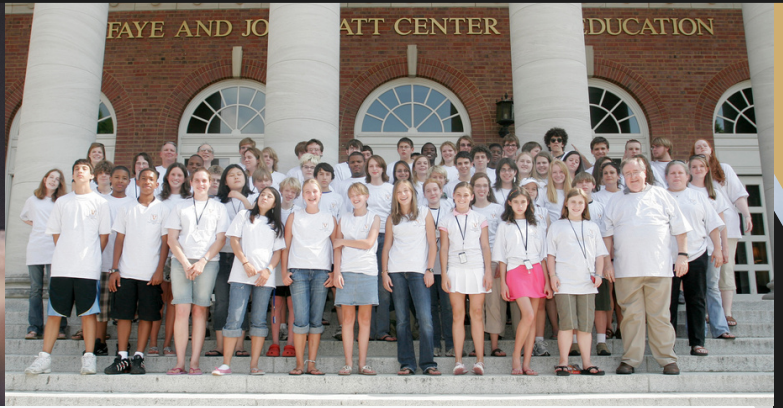
Left to right: Osher winter class at The Temple; Group photo of Program for Talented Youth students on the steps of Wyatt Center.