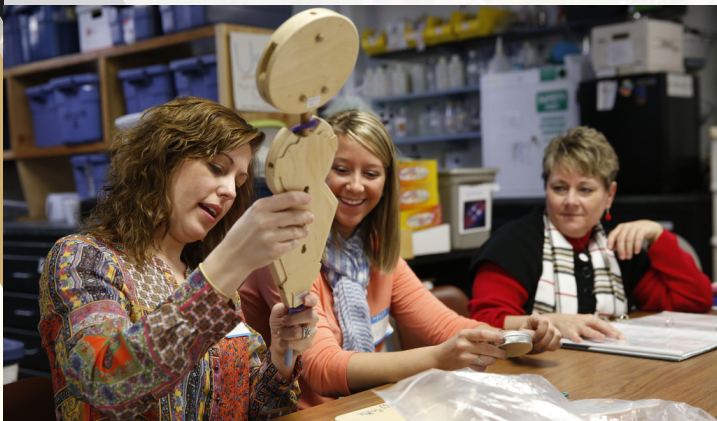
Left to right: A science lesson as part of the VSVS/VINSE outreach program; Next Steps graduation.

17 students enrolled in Next Steps at VU