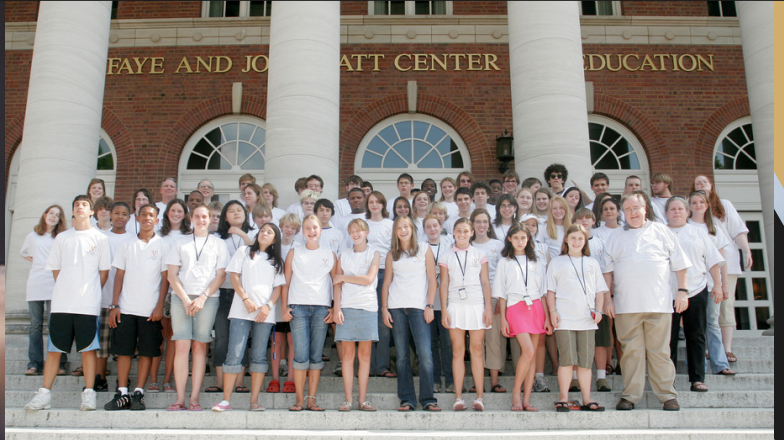
Left to right: Osher winter class at The Temple; Group photo of Program for Talented Youth students on the steps of Wyatt Center.