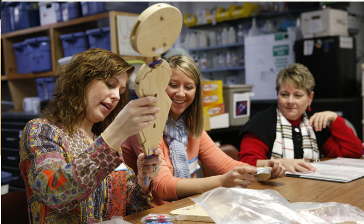
Left to right: A science lesson as part of the VSVS/VINSE outreach program; Next Steps graduation.