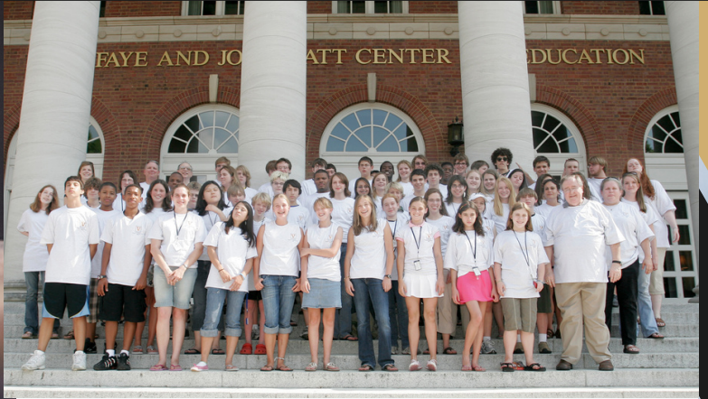
Left to right: Osher winter class at The Temple; Group photo of Program for Talented Youth students on the steps of Wyatt Center.