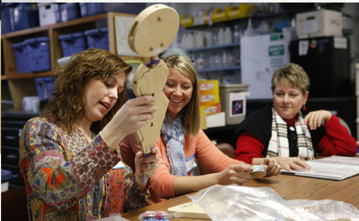
Left to right: A science lesson as part of the VSVS/VINSE outreach program; Next Steps graduation.

10 active companies formed in the last 10 years using Vanderbilt-owned intellectual property