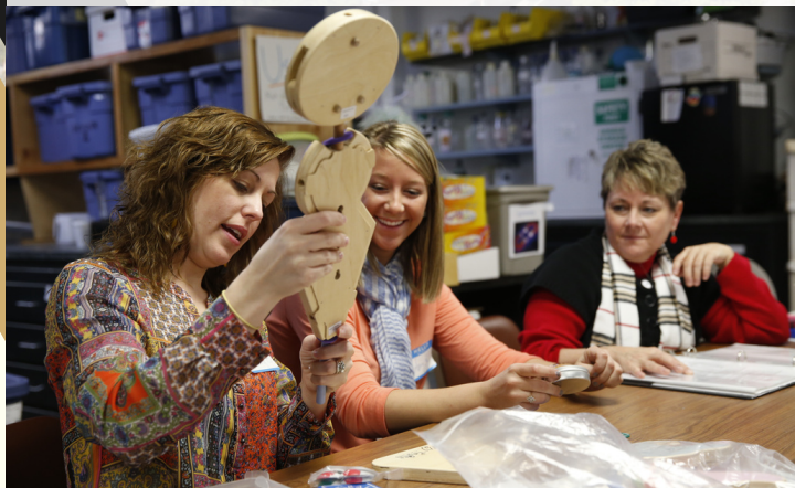
Left to right: A science lesson as part of the VSVS/VINSE outreach program; Next Steps graduation.

3 VU Peabody College student teacher placements in K-12 schools