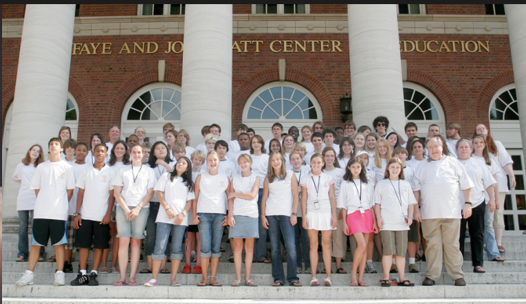
Left to right: Osher winter class at The Temple; Group photo of Program for Talented Youth students on the steps of Wyatt Center.