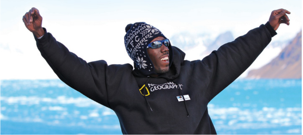
A guest marvels at landscape from aboard the ship.