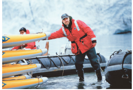
The expedition staff helps guests board kayaks safely and swiftly.

Every staff member—from our naturalists and expedition leaders to our crew working behind the scenes—is committed to ensuring guests have an unforgettable experience. Many are veteran polar guides who have worked with us for decades, chosen for their extensive knowledge of subjects like geology, wildlife biology and climate science. They, along with the guest speakers who join us on board, give rich context to the wildlife and landscapes we encounter ashore.