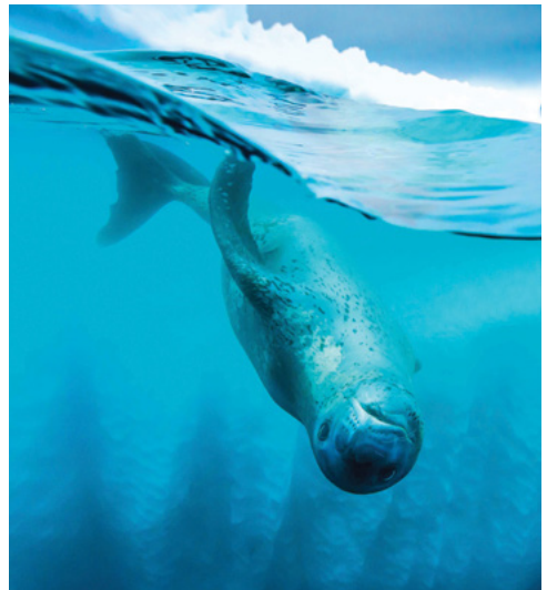
A curious adult leopard seal.

As part of our in-depth undersea program, an undersea specialist uses a high-definition video camera and deploys a remotely operated vehicle (ROV) that allows us to peer through steely polar waters—up to 1,000 feet beneath the surface. Footage is shared during Daily Recaps, inviting guests to witness surprising and unexpectedly colorful sea life from the comfort and safety of our ship.