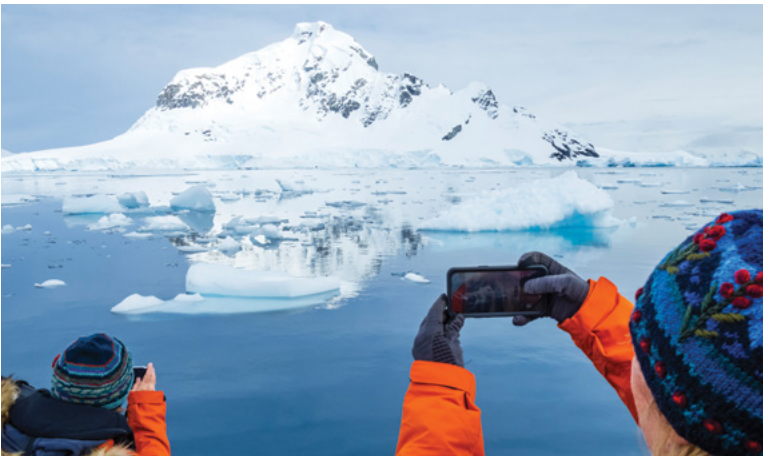
Guests photographing from a Zodiac in Paradise Harbor, Antarctica.

On a National Geographic-Lindblad Expeditions voyage, photography is never an afterthought—it's central to the expedition experience. A National Geographic photographer and a National Geographic-Lindblad Expeditions certified photo instructor join each voyage to assist travelers with everything from camera settings to composition. Every guest—from smartphone camera users to advanced hobbyists—can stand side by side with top photographers, pick up tips in the field and return home with the photos of a lifetime. With the complimentary OM System Photo Gear Locker, you can field test new lenses, camera bodies and more.