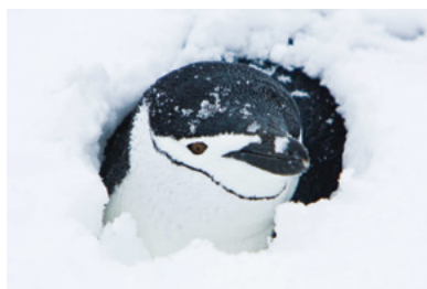
A chinstrap penguin burrowed in the snow.

Please note: Timing of flights to/from King George Island are weather dependent. Refer to www.expeditions.com/landing/fly-the-drake-faq for more details.