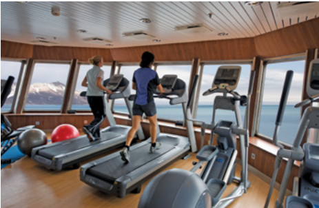
Fitness center with panoramic views.

Every staff member is committed to ensuring guests have an unforgettable experience. Many of the veteran guides and naturalists are locally based in your destination and have worked with the company for decades. A full-time medical professional, undersea specialist, National Geographic photographer and a certified photo instructor are on board, and with a high staff-to-guest ratio, you can hear different perspectives and gain new insights every day.