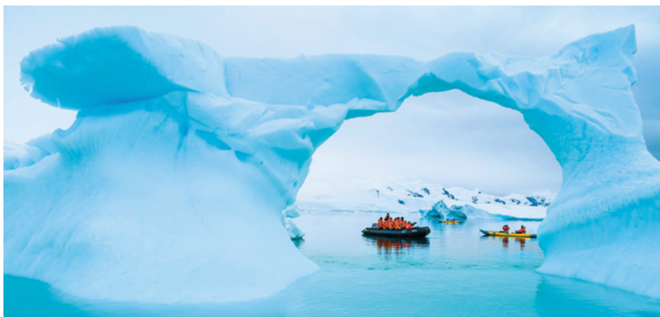
Guests exploring by Zodiac in Antarctica.