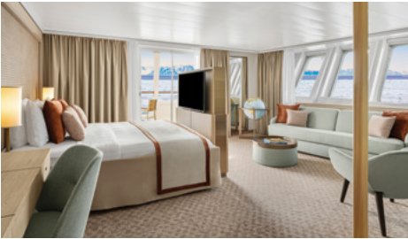
Category 7 suite with balcony.

All cabins and suites face outside with windows or portholes, and have a private bathroom and climate controls. Equipped with Wi-Fi, multiple electrical outlets, USB outlets, full-length mirror and phones.