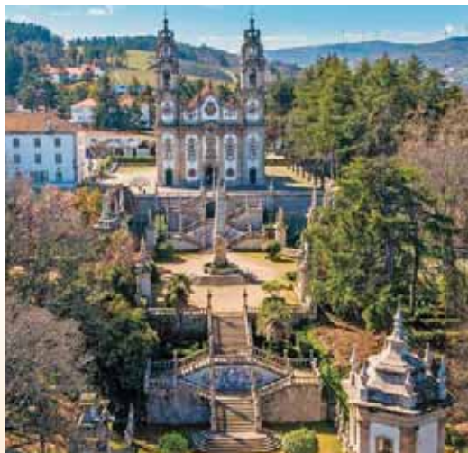
Nossa Senhora dos Remédios, Lamego