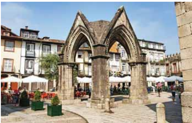
Old Town, Guimarães