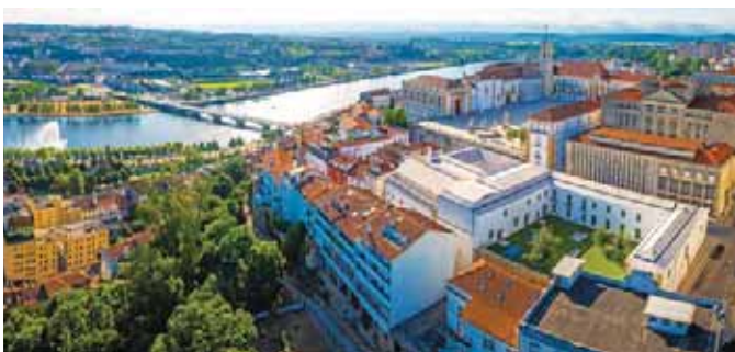
University of Coimbra