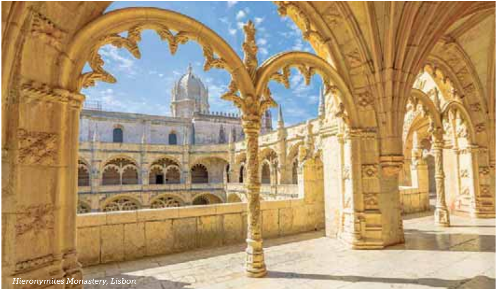
Hieronymites Monastery, Lisbon