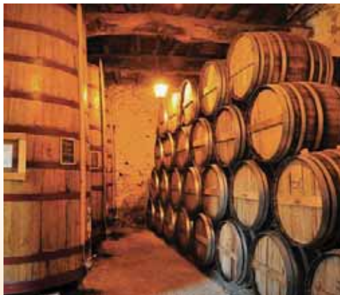
Port wine cellar

on a route with a beautiful view of Porto and Ribeira Square. Continue to a port wine cellar for a tasting. (Active)