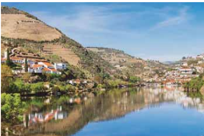
Douro River near Pinhão