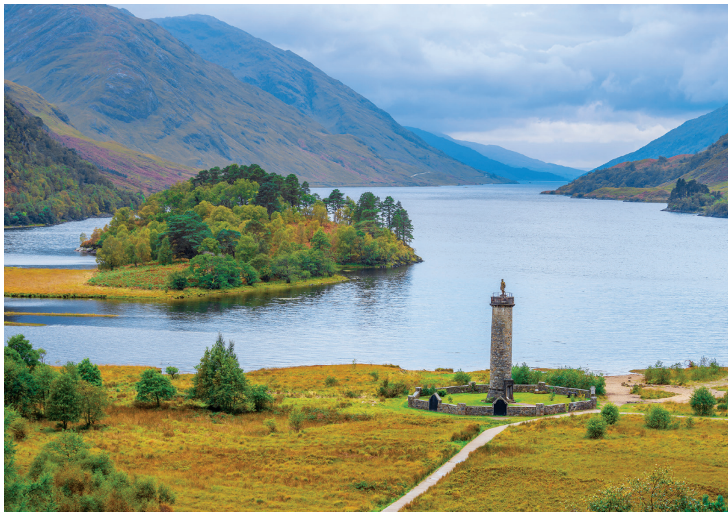
We'll visit the Glenfinnan Monument honoring "Bonnie Prince Charlie" on Day 5.

Day 5: Fort William/Isle of Skye We embark on a full-day excursion to the Isle of Skye, the largest of Scotland's Inner Hebrides, known for its vivid history, strong Gaelic influence, and stunning scenery. En route, we make a photo stop at Glenfinnan Monument, honoring "Bonnie Prince Charlie" for his leadership in the Jacobite Rising of 1745. Then we board a ferry for Armadale on the southern tip of the Isle of Skye. Our touring begins with a visit to Armadale Castle and Gardens, where we have lunch. Next we set out on a scenic drive through the imposing Cuillin Hills (or "Black Cuillin"). Returning to the mainland via the Skye Bridge, we stop to visit iconic Eilean Donan Castle then dine tonight at our hotel. B,L,D