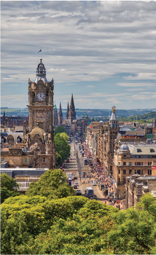
Edinburgh’s grand and historic Princes Street