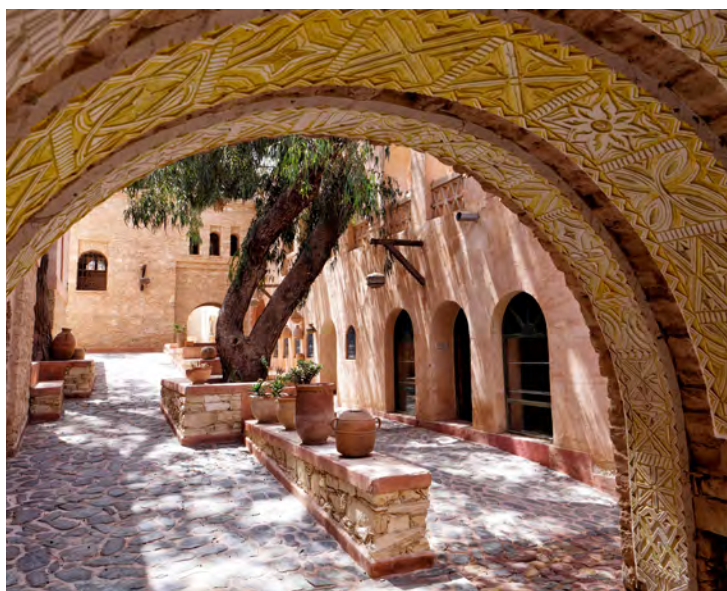
Medina, Agadir, Morocco

Begin at the Kasbah, the city's oldest site, offering sweeping views of the bay and the remnants of the original 16th-century fortress.