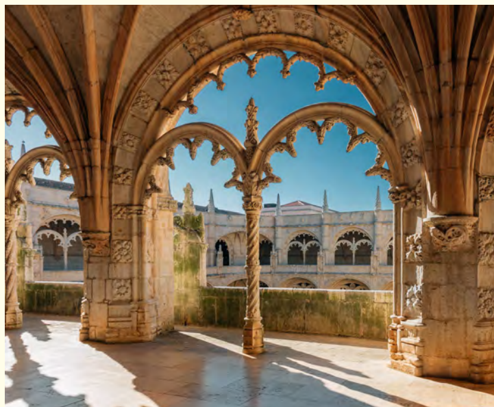
Jerónimos Monastery, Lisbon, Portugal

Journey west to the historic royal retreat of Sintra , a UNESCO-recognized center of 19th-century Romantic architecture. First, you may stop en route at Lisbon's 17th-century Palace of the Marquises of Fronteira , with its extensive azulejo tile collection depicting historical battles.