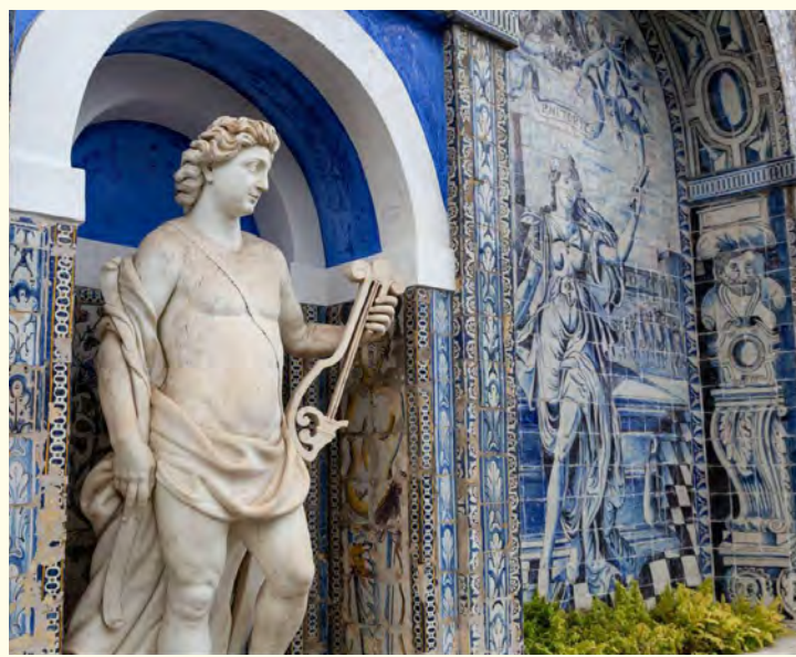
Palace of the Marquises of Fronteira, Sintra, Portugal

Includes: Economy-class, one-way flight (Málaga-Lisbon), two nights at Four Seasons Hotel Ritz Lisbon, with meals (B=Breakfast, L=Lunch, D=Dinner) and excursions as noted. See main program for exclusions. Note: Lecturer is scheduled on the main program only.