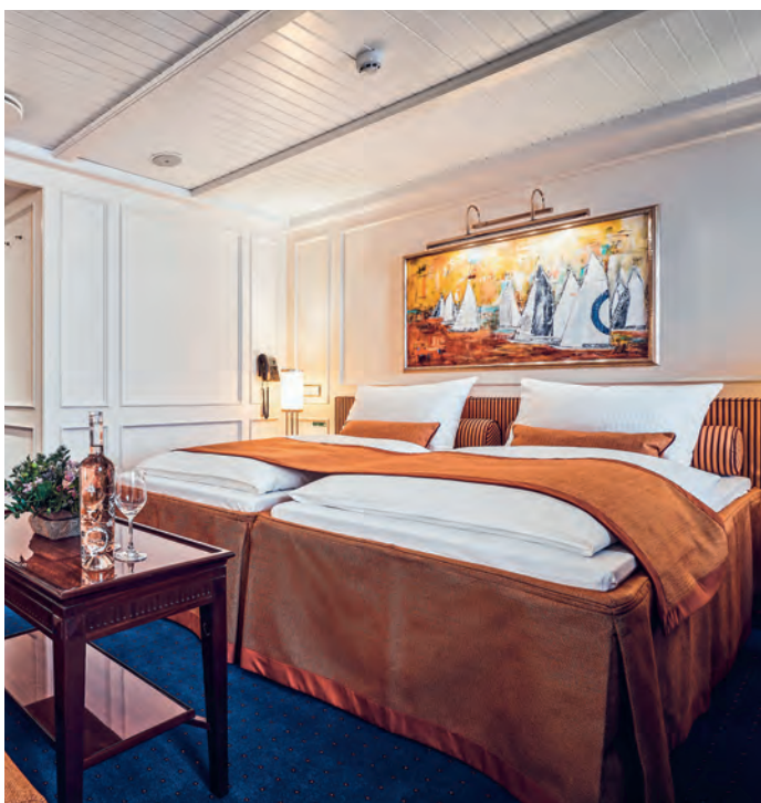
Junior Suite, Sea Cloud Spirit

The elegant Sea Cloud Spirit , the newest addition to the legendary Sea Cloud fleet, combines the romance of traditional sailing with the amenities of a modern luxury yacht. Handcrafted with meticulous attention to detail, the ship carries just 136 guests in beautifully appointed cabins and suites, many with private balconies. Guests enjoy refined service, fine dining inspired by Mediterranean traditions, and inviting spaces including a serene wellness and spa area, fitness center, and expansive open decks perfect for watching the sails unfurl. With her graceful design and state-of-the-art technology, Sea Cloud Spirit offers an unparalleled sailing experience that bridges timeless elegance and contemporary comfort.