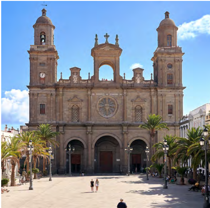
Las Palmas de Gran Canaria, Spain

This evening, join us for dinner aboard Sea Cloud Spirit as we sail to Lanzarote. D