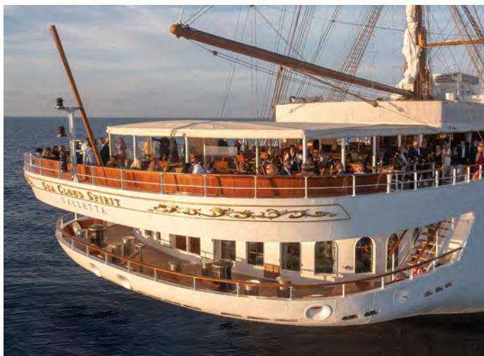
Sea Cloud Spirit

The elegant Sea Cloud Spirit , the newest addition to the legendary Sea Cloud fleet, combines the romance of traditional sailing with the amenities of a modern luxury yacht. Handcrafted with meticulous attention to detail, the ship carries just 136 guests in beautifully appointed cabins and suites, many with private balconies. Guests enjoy refined service, fine dining inspired by Mediterranean traditions, and inviting spaces including a serene wellness and spa area, fitness center, and expansive open decks perfect for watching the sails unfurl. With her graceful design and state-of-the-art technology, Sea Cloud Spirit offers an unparalleled sailing experience that bridges timeless elegance and contemporary comfort.