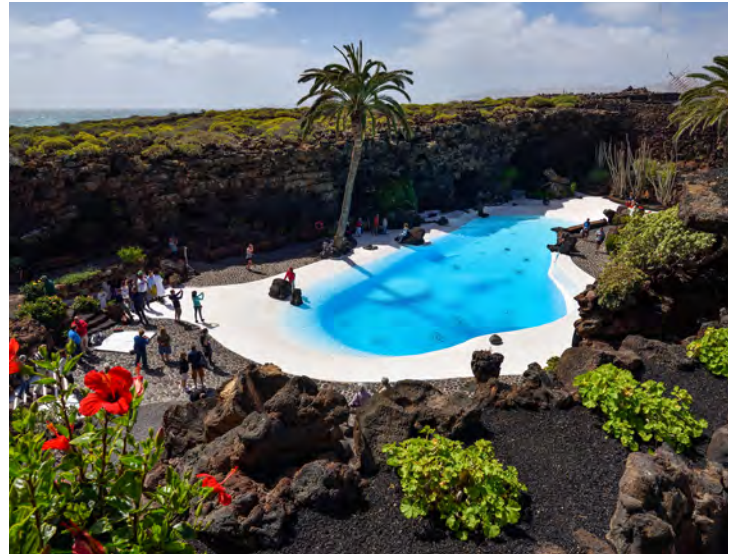
Los Jameos del Agua, Lanzarote