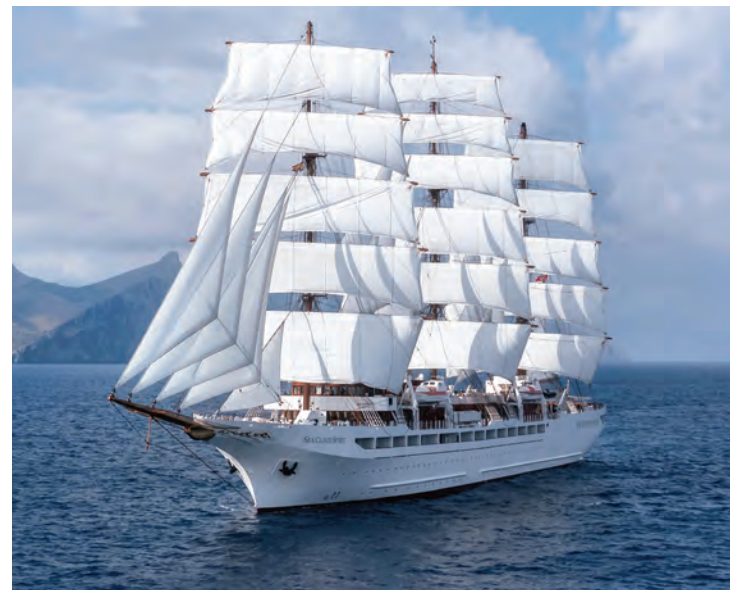
Sea Cloud Spirit