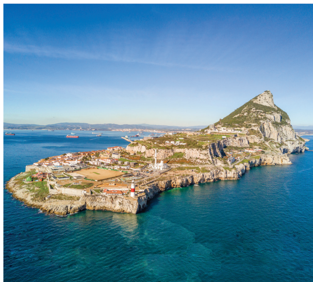
Gibraltar, United Kingdom

Visit Arrangements Abroad's website for more information about Activity and Pace Levels at www.arrangementsabroad.com/faqs .