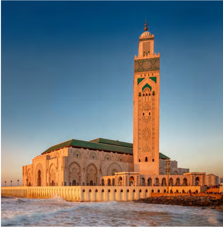
Hassan II Mosque, Casablanca, Morocco

Continue to La Médina d'Agadir, a recreated traditional village designed by artist Coco Polizzi, showcasing Moroccan craftsmanship in wood, metal, and ceramics.