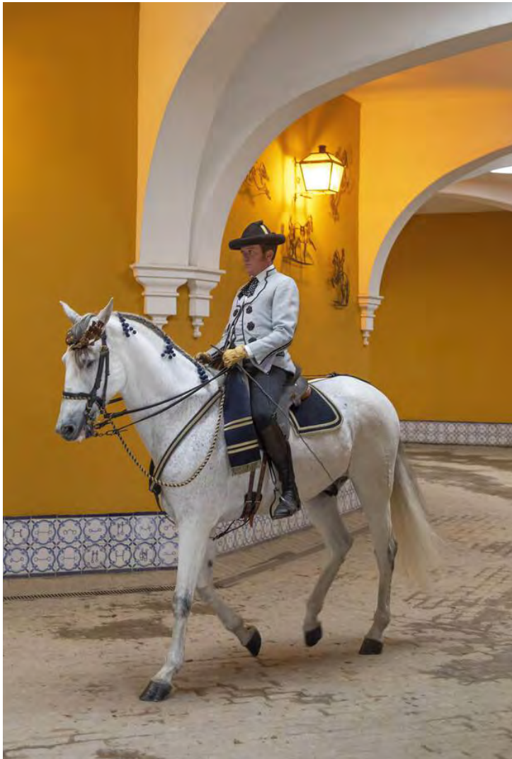
Royal Andalusian School of Equestrian Art, Jerez, Spain

Option 2: Jerez Sherry Experience. Go behind the scenes at Bodegas González Byass, the birthplace of Tío Pepe Fino. Learn secrets of sherry production inside 19th-century cellars, followed by a tasting with tapas . B,L,D