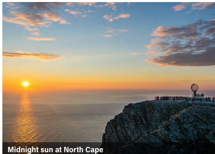
Midnight sun at North Cape

Sail to the remote beauty of Bear Island, a wildlife sanctuary tucked between mainland Norway and Svalbard. As Vega approaches