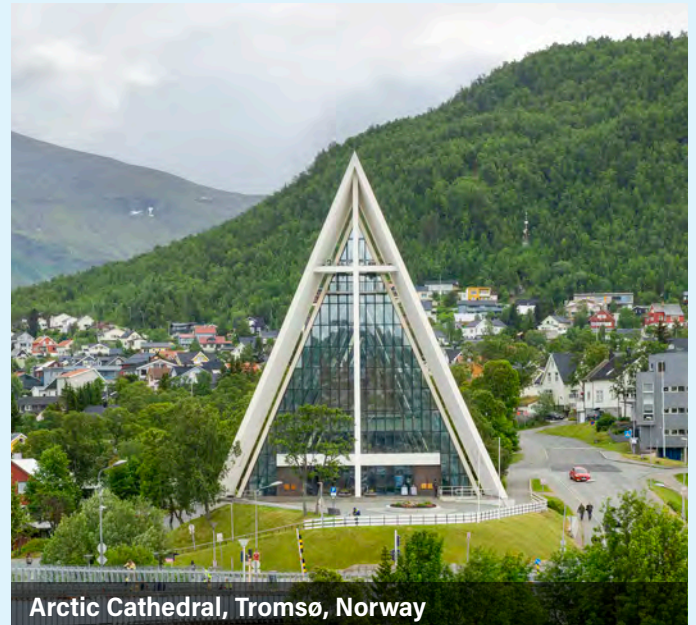
Arctic Cathedral, Tromsø, Norway

Our activities in Norway and Svalbard are planned and conducted by a team of expedition leaders and naturalists who are among the most experienced in the field, with several years of leading small-ship cruise expeditions to this incredible region of the world. Members of the team comprise a truly astonishing assortment of expertise and intellect. Onboard and ashore, through talks and presentations they will create a comprehensive understanding of the natural life, history and culture of this region. The experience we will provide is not just one of awe-inspiring sightseeing, but a complete learning adventure.