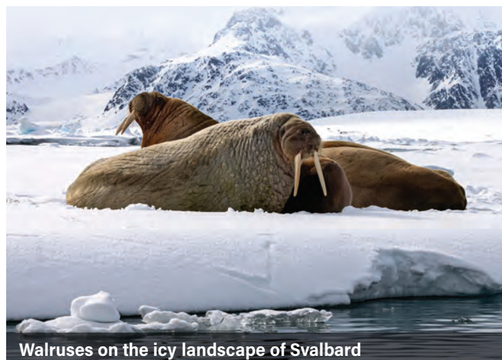
Walrus on the icy landscape of Svalbard