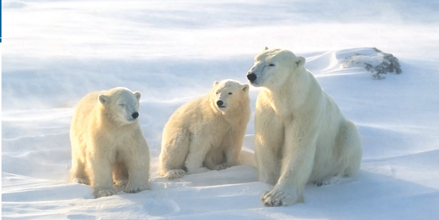
Polar bear with cubs, Svalbard

the island, prepare for breathtaking views of soaring cliffs teeming with life. Over a million seabirds—Puffins, Guillemots, Kittiwakes, and more—nest along these dramatic rock faces each summer, creating one of the Arctic's most extraordinary natural spectacles. Weather permitting, Zodiacs will bring you close to the action for unforgettable wildlife viewing. Our onboard naturalists will guide you through the island's unique ecosystem and its importance as a protected nature reserve. Rugged, uninhabited, and alive with sound and motion, Bear Island is a true hidden gem for nature lovers and adventurers alike. (B, L, D)