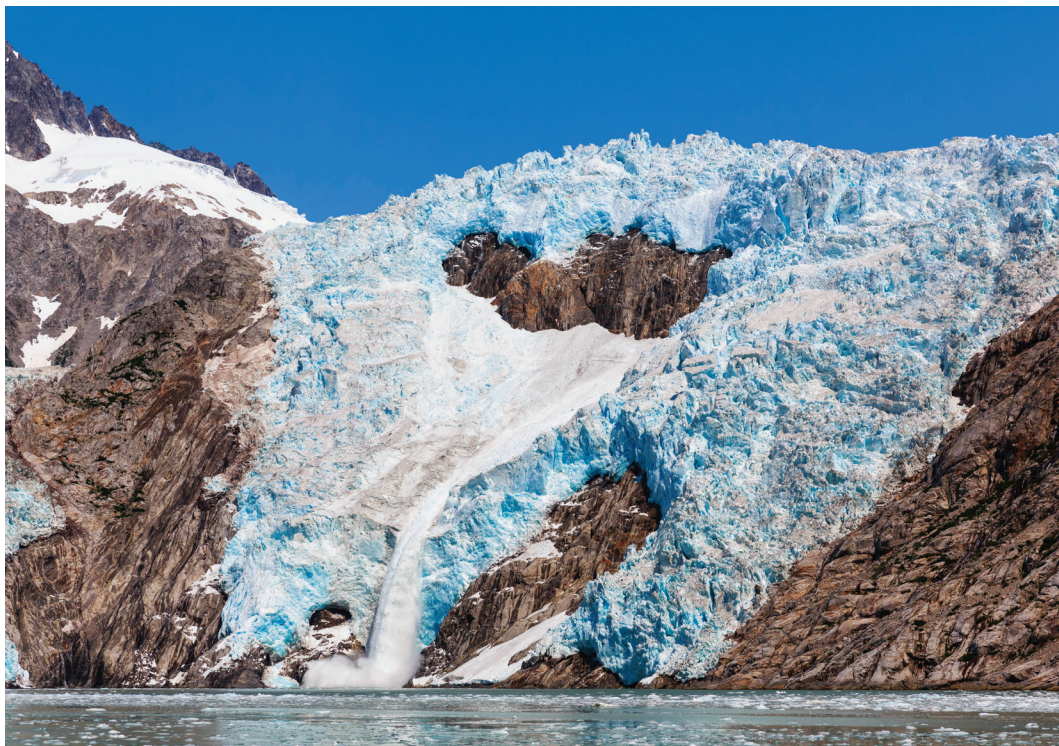
We see glaciers, wildlife, and marine life on a cruise to explore Kenai Fjords National Park.

Day 5: Denali National Park/Wrangell-St. Elias National Park We depart Denali by motorcoach this morning for the day-long journey to remote Chitina (pop. 126!). Here we board a prop plane for the scenic flight deep into Wrangell-St. Elias National Park, at 13.2 million acres the largest national park in the United States. Our destination: the historic copper mining towns of Kennicott/McCarthy, sitting deep within the park. During our 30-minute flight, we get our first views of the park's rugged wilderness, including 5,000 square miles of pristine glaciers, volcanoes, and mountain after mountain. Upon landing, we transfer to our lodge in the heart of Wrangell-St. Elias, overlooking 25 miles of glacier and surrounded by nine of the 16 highest mountain peaks in North America. We dine tonight at our lodge, the only one in Kennicott. B,L,D