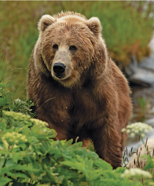
Colorful buildings overlook Seward's harbor.

Day 10: Seward/Anchorage Today we return to Anchorage, stopping for lunch on our own on the way. Upon arrival in Anchorage, we visit the Alaska Wildlife Conservation Center, a non-profit organization dedicated to providing quality animal care and preserving Alaska's wildlife. With 200 acres of spacious enclosures, the center offers an opportunity to see injured or orphaned bears, moose, elk, wolves, caribou, and more display their natural behavior in a