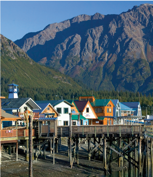
Colorful buildings overlook Seward's harbor.

safe environment. Tonight, we celebrate our journey through Alaska at a farewell dinner. B,D