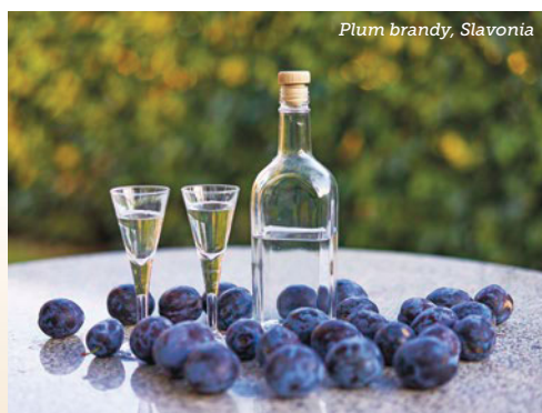
Plum brandy, Slavonia

• Science & Scientist Tour. Browse exhibits and films at the Nikola Tesla Museum.