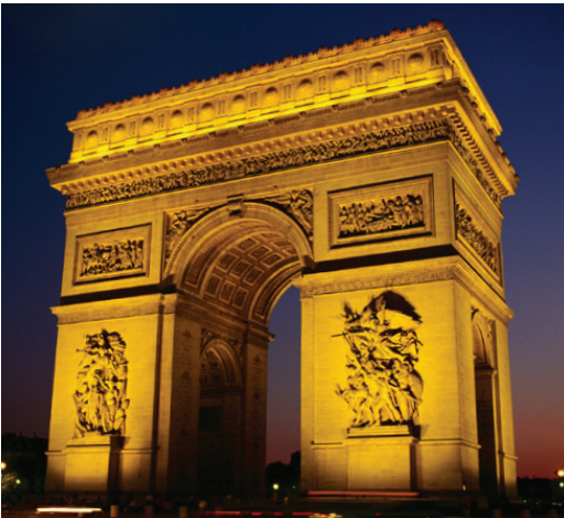
We may see the Arc de Triomphe during our free time in Paris.

Day 12: Depart Paris for U.S. We transfer to the airport this morning for our return flight to the United States. B