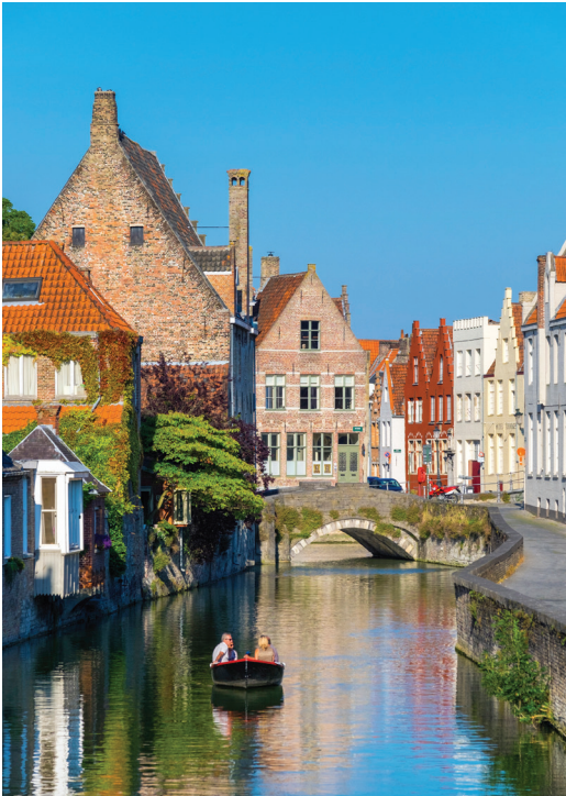
Canals wind through medieval Bruges.