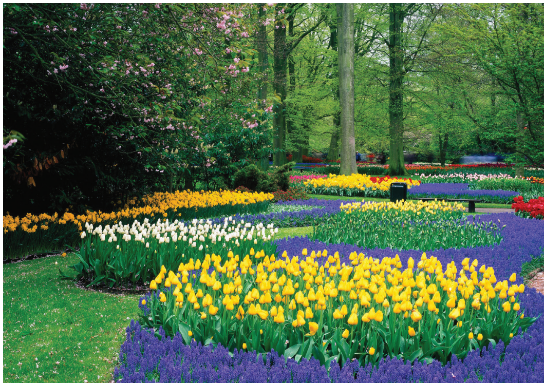
Tulips in bloom at Keukenhof

and, of course, to sample the goods. Next: a leisurely private cruise along the city's romantic canals. After lunch on our own, the remainder of the afternoon is ours to do as we wish in this beloved city. We meet up tonight for dinner together at a local restaurant. B,D