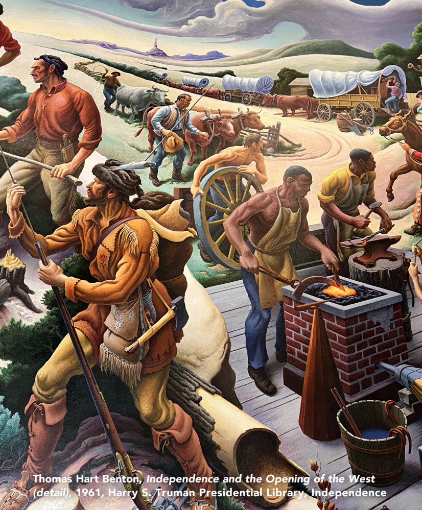
Thomas Hart Benton, Independence and the Opening of the West (detail), 1961, Harry S. Truman Presidential Library, Independence