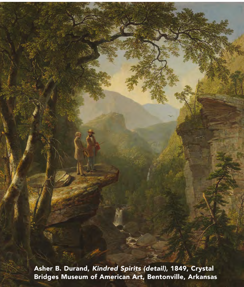
Asher B. Durand, Kindred Spirits (detail) , 1849, Crystal Bridges Museum of American Art, Bentonville, Arkansas

To reserve your place on this exclusive art journey, contact the Vanderbilt Travel Office at 615-322-3673 or alumni.travel@vanderbilt.edu .