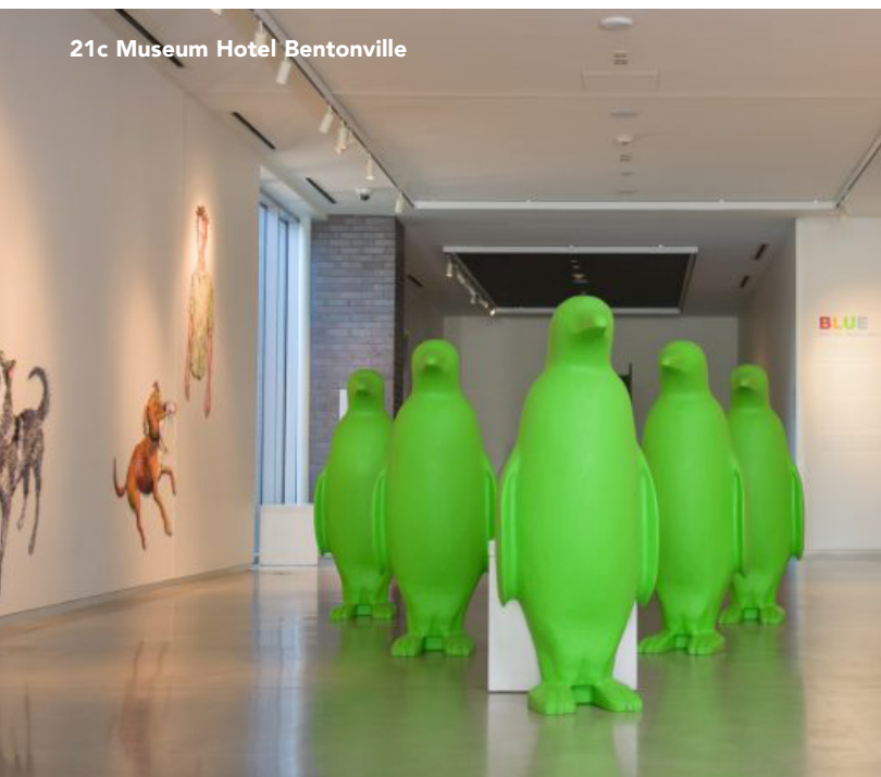
21c Museum Hotel Bentonville

In downtown Bentonville, this hideaway pairs Southern hospitality with contemporary art and sleek design. Rotating exhibitions and site-specific installations fill the public spaces.