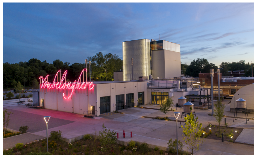
Photos clockwise from top right: Map of the region; Frank Lloyd Wright's Bachman-Wilson House, Crystal Bridges Museum of American Art, Bentonville; ; The Momentary, Bentonville; Sol Lewitt, Loopy Doopy , 1998, Crystal Bridges Museum of American Art, Bentonville; and Louise Bourgeois, Spider , 1996, cast 1997, Kemper Museum of Contemporary Art, Kansas City.