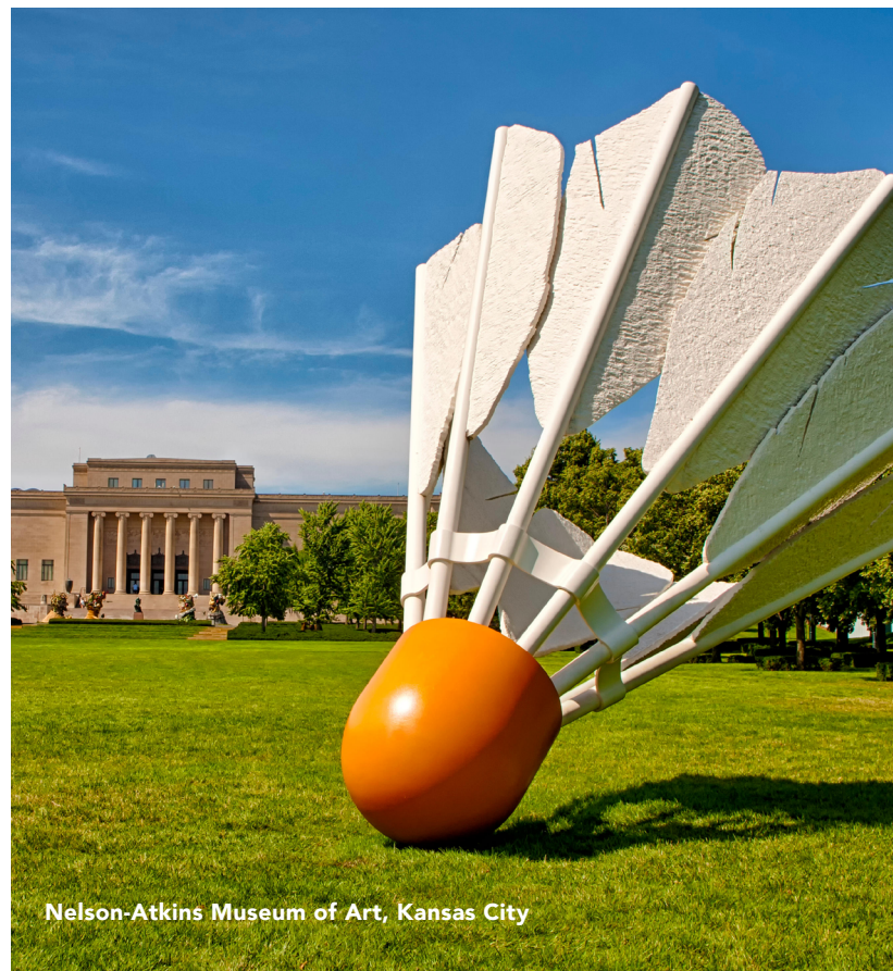
Nelson-Atkins Museum of Art, Kansas City