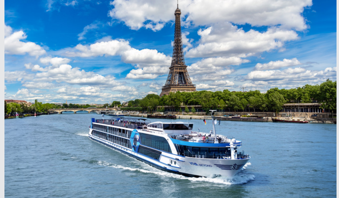
Viva Beyond Exclusively Chartered, Deluxe River Boat