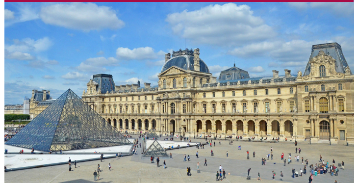
Paris | 4 days, 3 nights September 10 to 13, 2026 | Program Begins: September 11