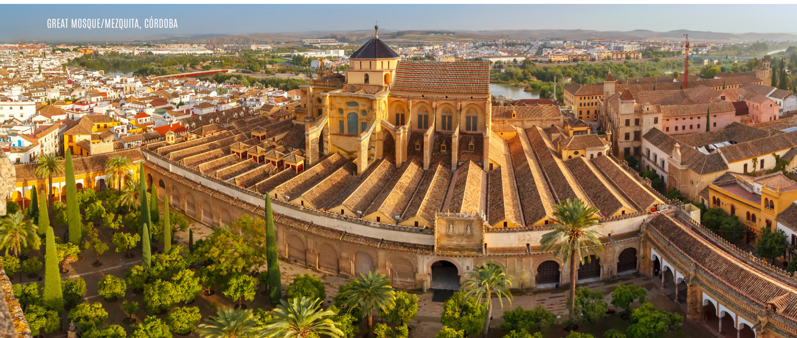
GREAT MOSQUE/MEZQUITA, CÓRDOBA

Embark on a walking tour through the winding streets of Madrid's historic city center, where we'll discover some of the most emblematic places in the city, including Plaza de la Villa, Plaza Mayor, Puerta del Sol, and Plaza de Oriente. We'll visit the Palacio Real, the largest royal palace in western Europe measuring 1,450,000 square feet and made up of 3,418 rooms. As the official residence of the royal family, it plays host to some of the most important state receptions and ceremonies of the Crown. A tour of the interior transports you to a world of opulence and grandeur, with exquisite architectural details and rooms filled with musical instruments, including several Stradivarius violins, beautiful