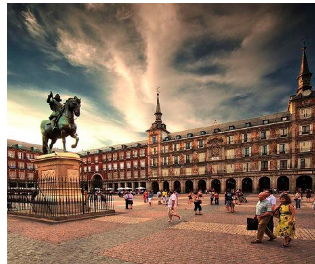
TOP: PAINTED TILE. BOTTOM, LEFT TO RIGHT: GENERALIFE GARDENS, ALHAMBRA; SPANISH WOMAN; PLAZA MAYOR, MADRID

collections of porcelain, and paintings by such artists as Goya, Caravaggio and Velázquez. Enjoy a tapas-style lunch before enjoying the remainder of the day at leisure.