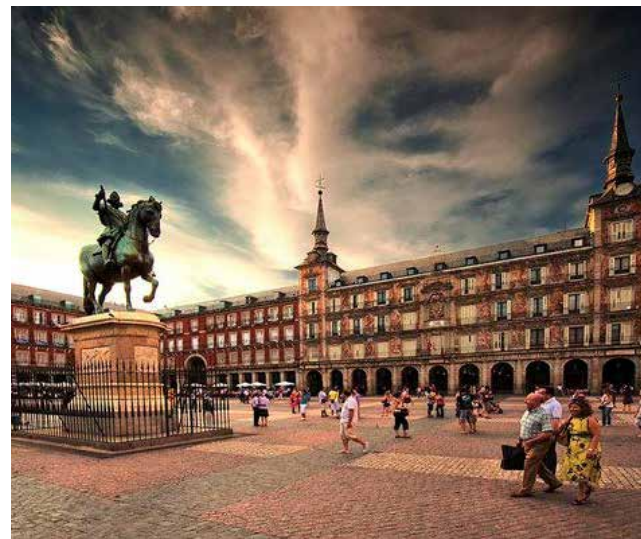
TOP: PAINTED TILE. BOTTOM, LEFT TO RIGHT: GENERALIFE GARDENS, ALHAMBRA; SPANISH WOMAN; PLAZA MAYOR, MADRID

collections of porcelain, and paintings by such artists as Goya, Caravaggio and Velázquez. Enjoy a tapas-style lunch before enjoying the remainder of the day at leisure.