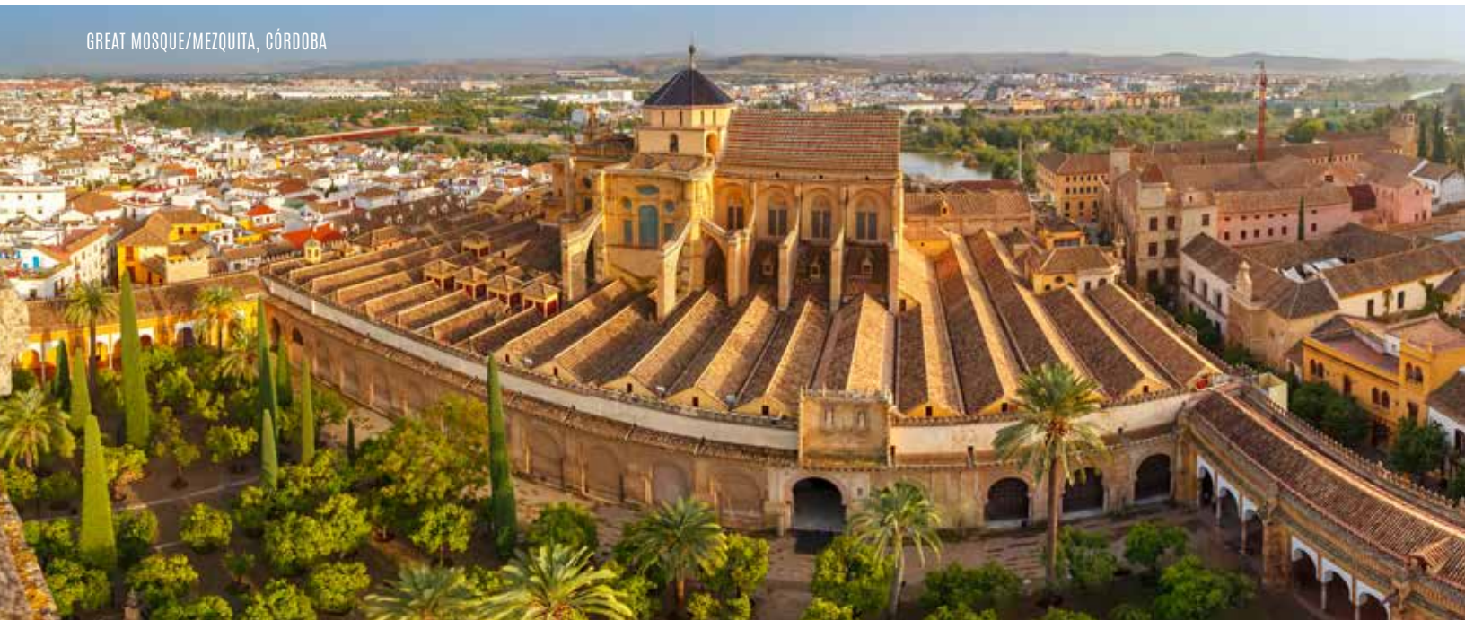
GREAT MOSQUE/MEZQUITA, CÓRDOBA

Embark on a walking tour through the winding streets of Madrid's historic city center, where we'll discover some of the most emblematic places in the city, including Plaza de la Villa, Plaza Mayor, Puerta del Sol, and Plaza de Oriente. We'll visit the Palacio Real, the largest royal palace in western Europe measuring 1,450,000 square feet and made up of 3,418 rooms. As the official residence of the royal family, it plays host to some of the most important state receptions and ceremonies of the Crown. A tour of the interior transports you to a world of opulence and grandeur, with exquisite architectural details and rooms filled with musical instruments, including several Stradivarius violins, beautiful