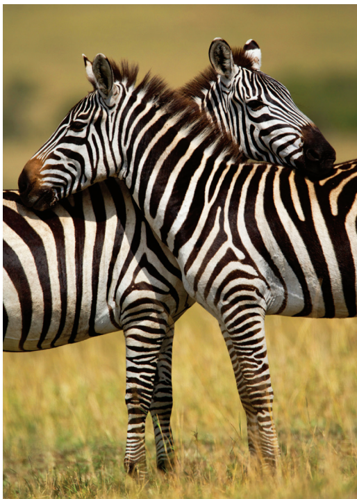
We're sure to see zebras.

Day 16: Arrive U.S. We reach the U.S. today and connect with our flights home.