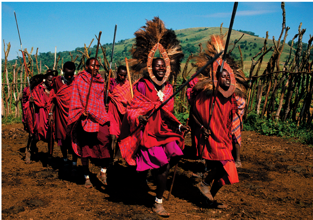
We visit a Maasai village to learn about their culture.

Day 8: Ngorongoro Crater On our morning tour of the 100-square-mile crater, we have our only chance to see all of Africa’s “Big Five” – elephant, buffalo, rhino, lion, and leopard – in one place. B,L,D