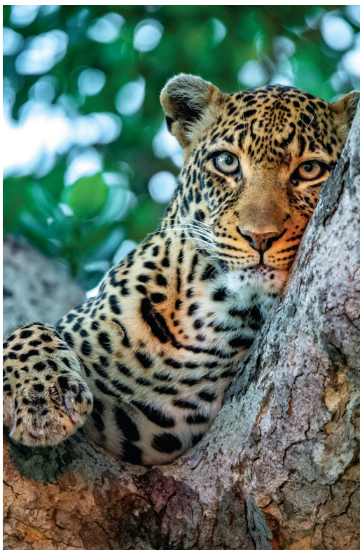
Leopard in the Serengeti