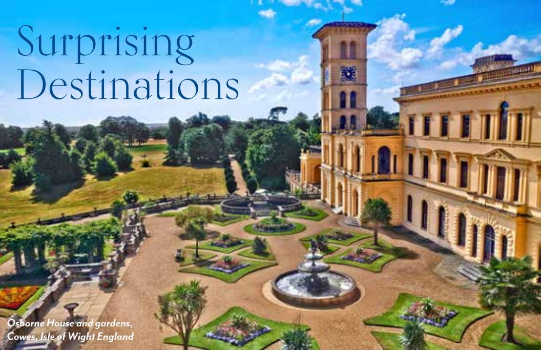
Osborne House and gardens, Cowes, Isle of Wight England

The seaside town of Cowes on the Isle of Wight is a festive harbor town known for its yachting culture and sailing races. Along with a lovely Parade and Esplanade, Cowes boasts a charming High Street filled with boutiques, galleries and restaurants (it is rumored that Cowes has more eateries per square mile than any other town in the U.K.!). More famously, Cowes is home to Osborne House, Queen Victoria's beloved vacation home. "It's hard to imagine a lovelier spot," the queen proclaimed. Yet many international travelers have not been here. And what about Tresco, on the Isles of Scilly? One of the first surprises about Tresco is that, even though it is situated off the chilly coast of Cornwall, it supports a subtropical garden filled with exotic plants, many of which bloom all year. Tour this lush parkland, built around a crumbling 11th-century abbey, and marvel at the thousands of plants. Another surprise? The Valhalla Museum located within the gardens, home to figureheads and other ships' carvings salvaged from area shipwrecks since 1840. These surprising delights — as well as many other lovely adventures — await you as you tour the British and Emerald Isles!