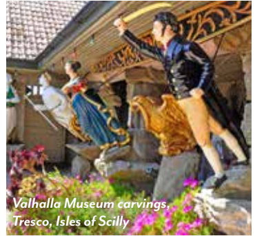
Valhalla Museum carvings, Tresco, Isles of Scilly

The seaside town of Cowes on the Isle of Wight is a festive harbor town known for its yachting culture and sailing races. Along with a lovely Parade and Esplanade, Cowes boasts a charming High Street filled with boutiques, galleries and restaurants (it is rumored that Cowes has more eateries per square mile than any other town in the U.K.!). More famously, Cowes is home to Osborne House, Queen Victoria's beloved vacation home. "It's hard to imagine a lovelier spot," the queen proclaimed. Yet many international travelers have not been here. And what about Tresco, on the Isles of Scilly? One of the first surprises about Tresco is that, even though it is situated off the chilly coast of Cornwall, it supports a subtropical garden filled with exotic plants, many of which bloom all year. Tour this lush parkland, built around a crumbling 11th-century abbey, and marvel at the thousands of plants. Another surprise? The Valhalla Museum located within the gardens, home to figureheads and other ships' carvings salvaged from area shipwrecks since 1840. These surprising delights — as well as many other lovely adventures — await you as you tour the British and Emerald Isles!