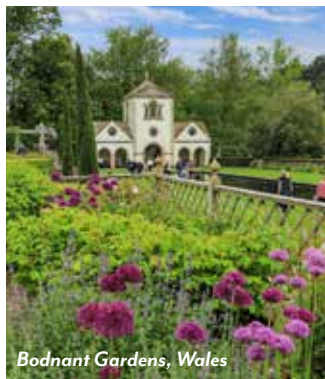
Bodnant Gardens, Wales

Enjoy a guided panoramic tour of Dublin, featuring St. Patrick’s and Christ Church cathedrals, Trinity College, and the UNESCO-inscribed Book of Kells, an illuminated manuscript believed to have been created in A.D. 800. Cruise grand O’Connell Street, lined with statues of Irish statesmen. This evening, enjoy a presentation of traditional Irish music and dance on board. (B,L,D)