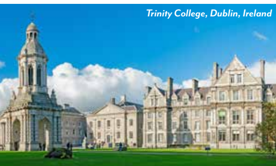
Trinity College, Dublin, Ireland

Following breakfast, disembark and transfer to the airport for your return flight. (B)