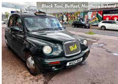
Black Taxi, Belfast, Northern Ireland