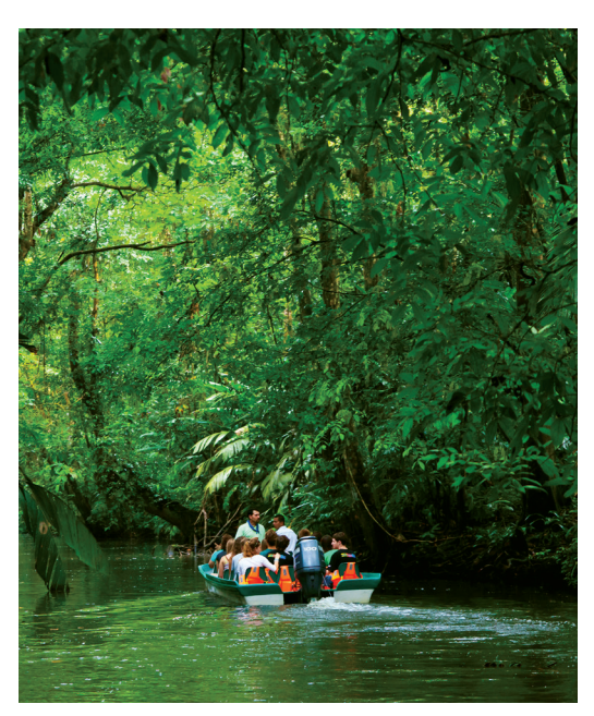
We explore Tortuguero's canals on the pre-tour option.

Day 11: Depart for U.S. We transfer to the airport this morning for our return flights to the U.S. B