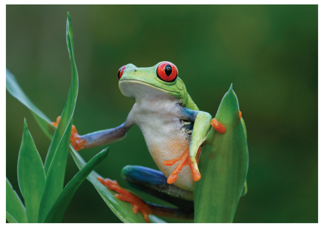
We see many colorful tree frogs in Costa Rica's rainforests.

Day 5: Arenal Region On this morning's visit to Arenal's Mistico Park hanging bridges, we have the special opportunity to experience the rainforest from the canopy level as we traverse a series of five suspension bridges high above the forest floor. While we observe the rainforest from a unique perspective, our naturalist guide will point out some of the flora and fauna that thrive here. Then we return to our hotel, where the remainder of the day is at leisure to relax amidst the beautiful grounds and thermal waters. Lunch and dinner today are on our own. B