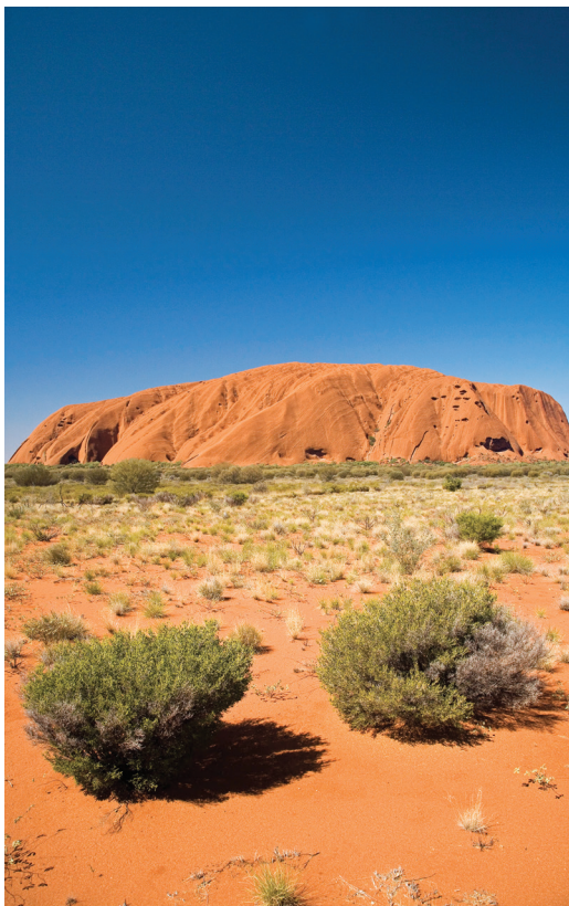
Aboriginal site of Uluru (Ayers Rock)