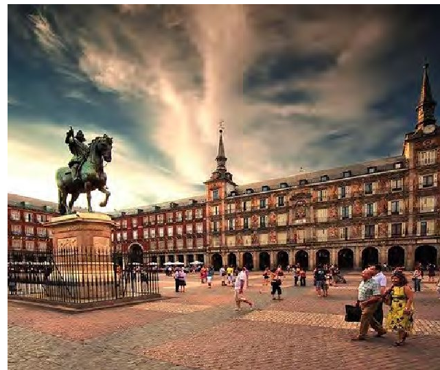
TOP: PAINTED TILE. BOTTOM, LEFT TO RIGHT: GENERALIFE GARDENS, GRANADA; SPANISH WOMAN; PLAZA MAYOR, MADRID.

some of the most important state receptions and ceremonies of the Crown. A tour of the interior transports you to a world of opulence and grandeur, with exquisite architectural details and rooms filled with musical instruments, including several Stradivarius violins, beautiful collections of porcelain, and paintings by such artists as Goya, Caravaggio and Velázquez. Enjoy a tapas-style lunch before enjoying the remainder of the day at leisure. HOTEL WELLINGTON or similar (B, L)