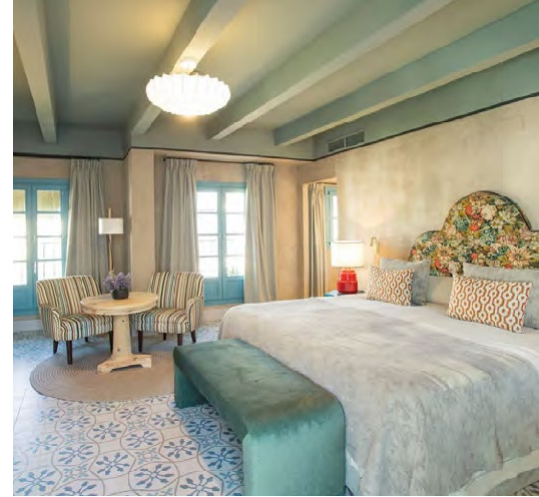
COLUMNS FROM LEFT TO RIGHT: HOTEL WELLINGTON, MADRID; HOTEL VILLA ONIRIA, GRANADA; HOTEL HOSPES CASAS DEL REY DE BAEZA, SEVILLE