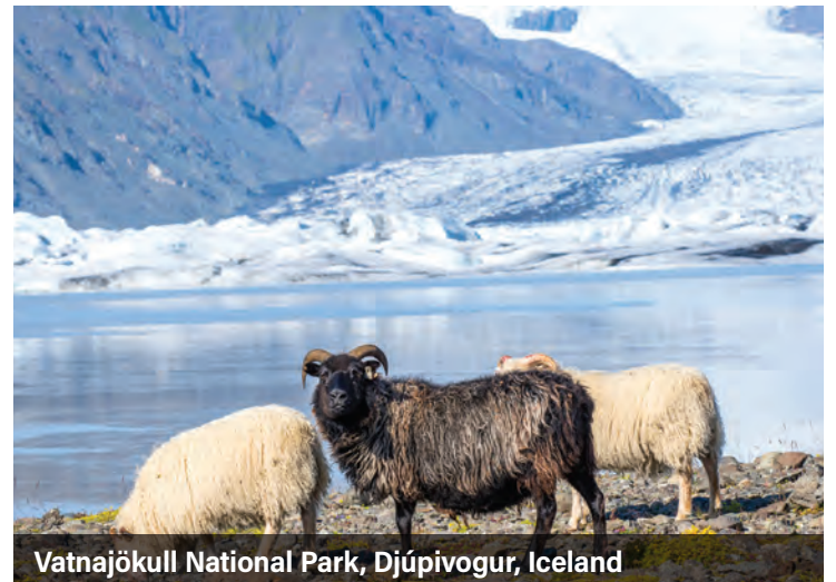
Vatnajökull National Park, Djúpivogur, Iceland

After breakfast aboard, transfer to the airport for flights homeward. (B)