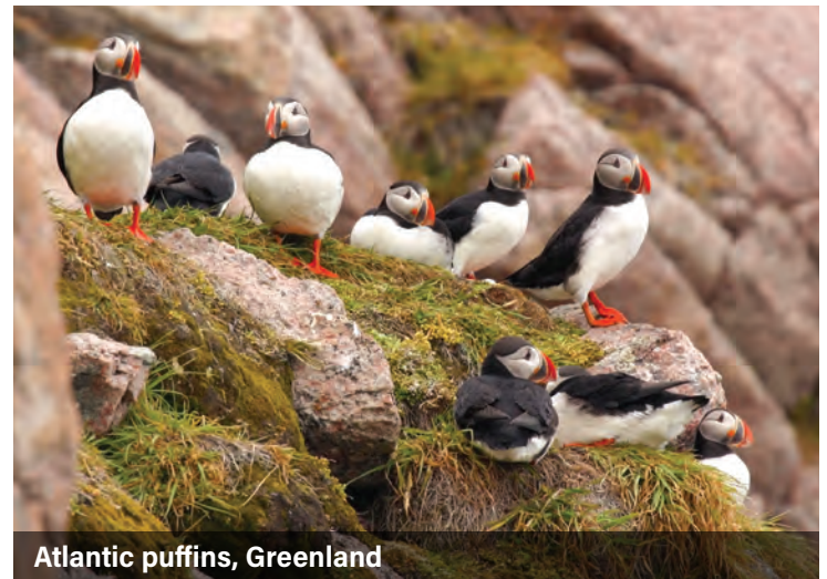
Atlantic puffins, Greenland

Enjoy a day at sea, attend lectures by your special guest lecturer and