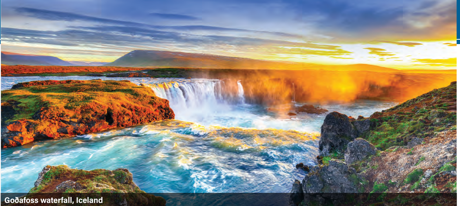
Goðafoss waterfall, Iceland

briefings from the expert expedition staff. Also use the time simply to relax and enjoy cruising the open sea, perhaps treating yourself to some of Vega's many amenities. (B,L,D)