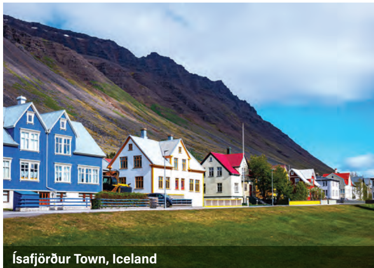
Ísafjörður Town, Iceland

Djúpivogur, in southeastern Iceland, is a small town on a peninsula near the mouth of Berufjörður fjord, with an awe-inspiring