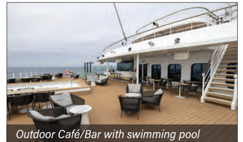
Outdoor Café/Bar with swimming pool

Built in Finland and launched in July 2022, Swan Hellenic's Vega is a new-generation expedition cruise ship. Although at 10,250 tons the ship is large enough to accommodate more than 250 passengers, Vega will accommodate a maximum of 152 guests in 76 spacious staterooms and balcony suites. The low guest density results in one of the most generous indoor and outdoor space-to-guest ratios among cruise ships.