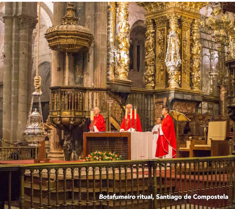
Botafumeiro ritual, Santiago de Compostela

DISCLAIMER: The itinerary is subject to change at the discretion of Vanderbilt University and Arrangements Abroad. For complete details, please carefully read the terms and conditions at www.arrangementsabroad.com/terms .