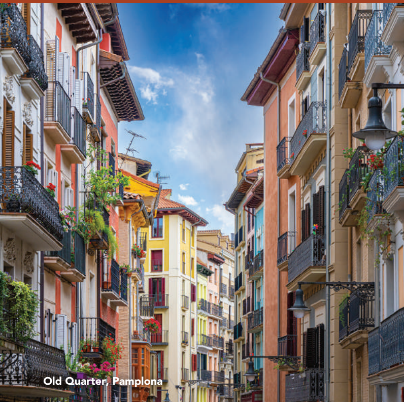
Old Quarter, Pamplona