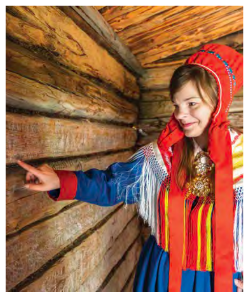
Sámi woman, Sámi Museum Siida

every second night in northern Lapland, weather permitting. Savor a refreshing break by a fire, complemented by toasty beverages, snacks and tales about the Northern Lights.