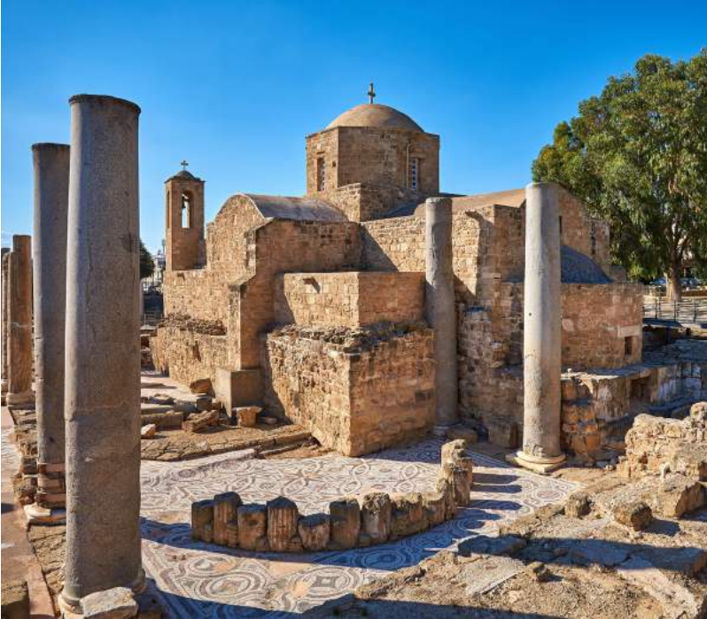
Church of Chrysopolitissa, Paphos

Afterwards, experience Omodos's long tradition in winemaking, stopping to sample local wines and liqueurs. Then savor a mezze lunch of local dishes at a traditional taverna in the village.