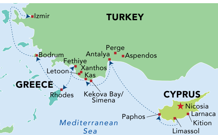
Map of the region