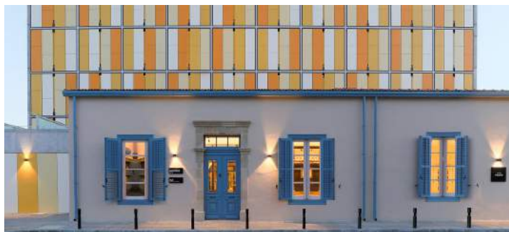
Indigo Hotel Larnaca

Nestled amid Larnaca's graceful old townhouses, this hotel offers a harmonious blend of historic charm and contemporary design, mirroring the essence of the city itself. Nearby, you'll find the historic ninth-century Church of St. Lazarus and the medieval castle of Larnaca. A short walk away, the Finikoudes beach promenade, a highlight of Larnaca, offers a splendid way to appreciate the city's scenic beauty. The hotel features a striking rooftop pool, an elegant Wine Bar, and the Courtyard Restaurant. Each bedroom is equipped with rainfall showers, state-of-the-art technology, and a private balcony, ensuring a comfortable and luxurious stay.