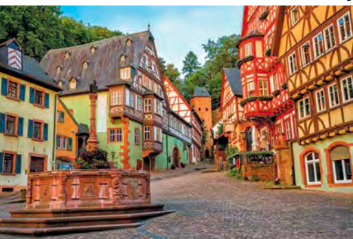
Half-timbered homes, Miltenberg