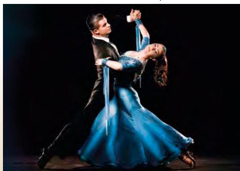
Waltz performance, Vienna