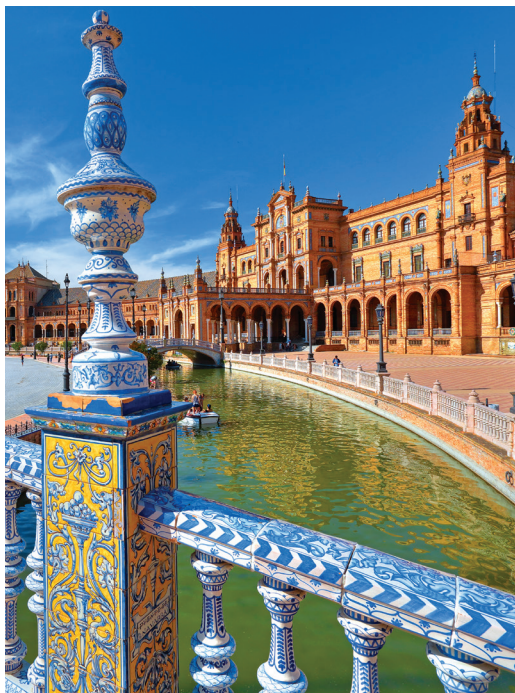
Seville’s colorful Plaza de España