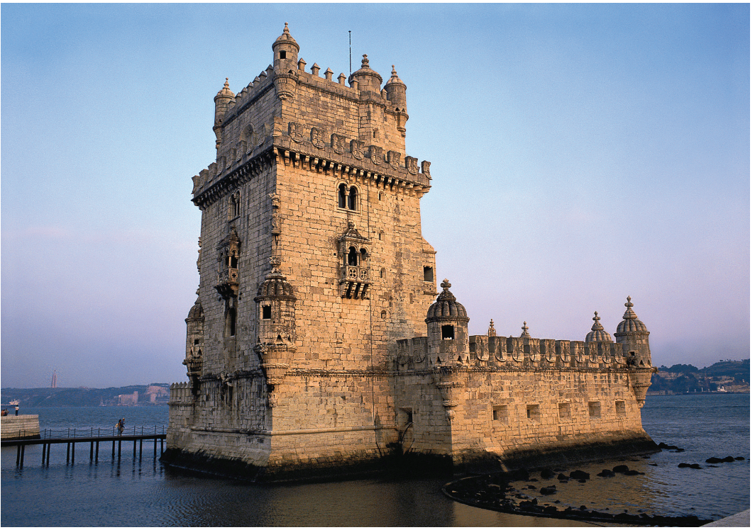
We see iconic Belém Tower, the most photographed monument in Portugal, on Day 3.

place that inspired Carmen and Don Giovanni ; where fragrant orange trees and flower-bedecked balconies delight the senses; and home of the renowned Catédral, the world's largest Gothic building. After a tour that includes the Alcazar palace and the Arab quarter, the afternoon is free to explore independently. We return to Carmona late afternoon and dine at our parador this evening. B,D