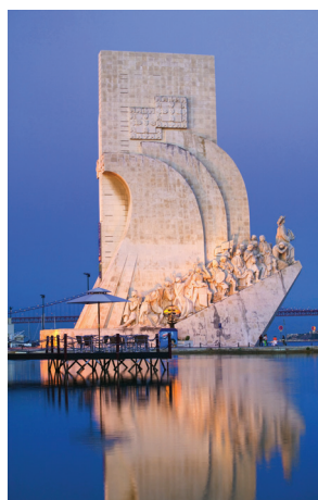
Lisbon’s Monument to the Discoveries

Day 13: Madrid Our morning tour of this monumental and dignified capital city includes vast Plaza Mayor; the Moorish medieval district; and opulent