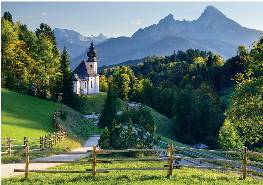
Majestic Alpine scenery surrounds us throughout our tour.

Pass through the Alps. Late morning, we arrive in Stresa, Italy, along the shores of lovely Lake Maggiore, where we have time to explore and enjoy lunch on our own. Then a scenic drive through the famed Italian lake district returns us to Switzerland and our hotel in lakeside Lugano. B,D