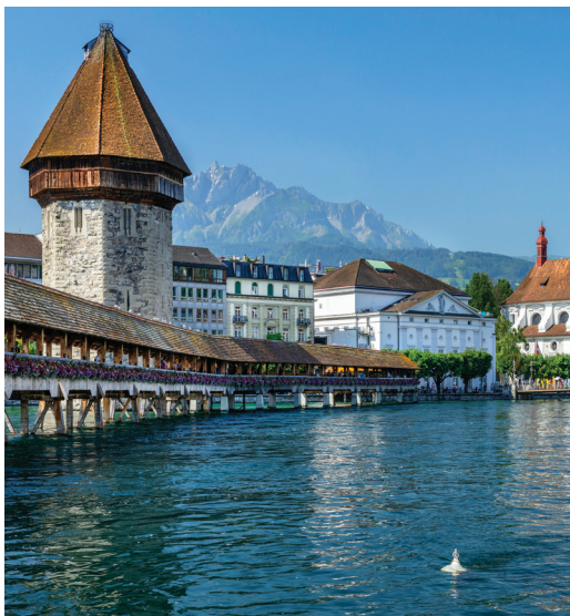
Lucerne’s beloved Kapellbrücke (Chapel Bridge)