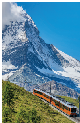
The Gornergratbahn railway

Day 12: Salzburg Our walking tour this morning features the the 17 th -century Mirabell Gardens; the Baroque Old Town, now a UNESCO site; and visits to Salzburg Cathedral and medieval Hohensalzburg Fortress, one of Europe’s largest and best-preserved castles. Then the remainder of the day is at leisure for independent exploration and dinner on our own. B