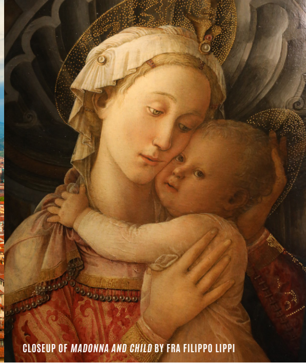
CLOSEUP OF MADONNA AND CHILD BY FRA FILIPPO LIPPI