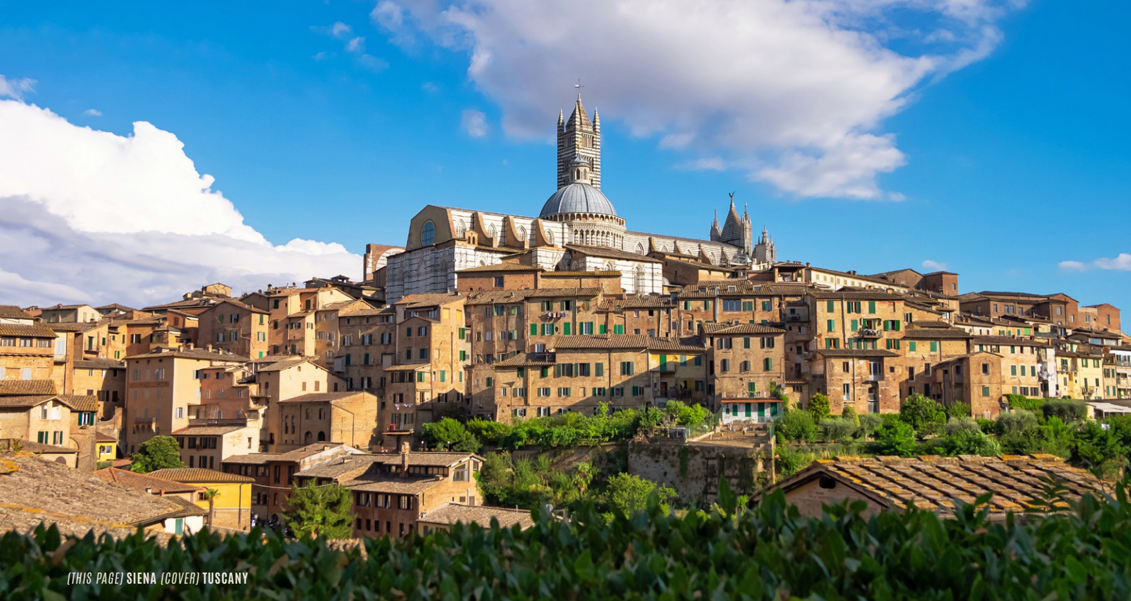
(THIS PAGE) SIENA (COVER) TUSCANY