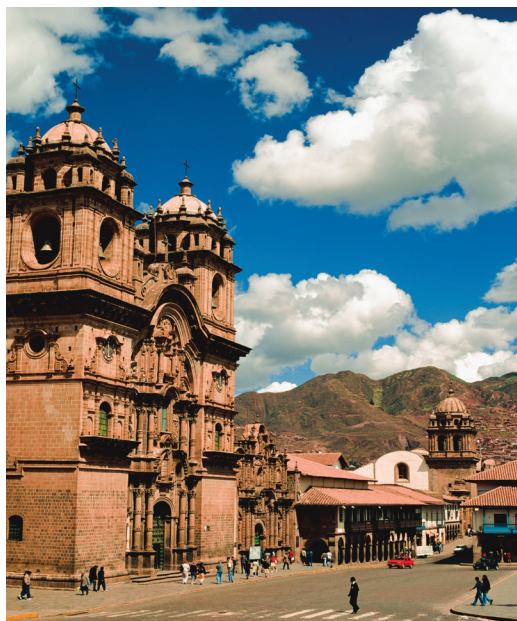
Plaza de Armas, Cuzco

Day 10: Puno/Lima/Depart for U.S. This morning we visit the mysterious burial towers ( chullpas ) at Sillustani over-looking Lake Umayo. After lunch we transfer to the airport for the flight to Lima, where we check into our day rooms at an airport hotel. Late this evening we depart on our flight to the U.S. B,L