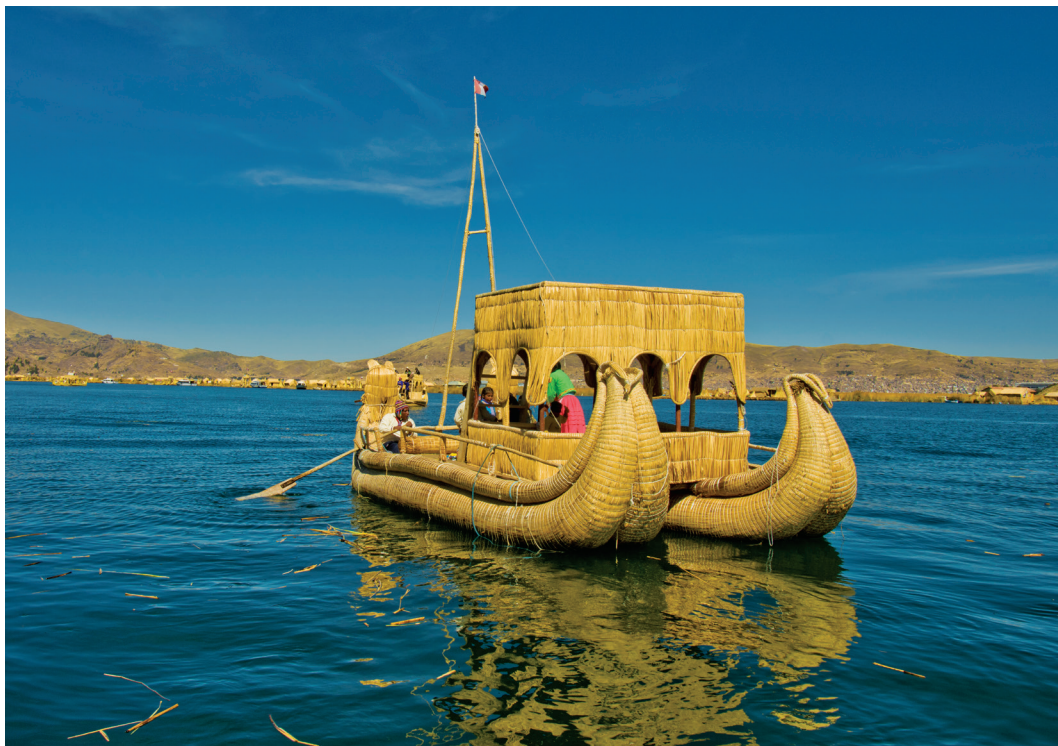
Uros islanders' reed boat sails Lake Titicaca.

Aguas Calientes and our hotel, with time at leisure before dinner together tonight. B,L,D