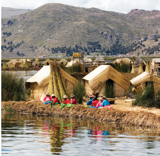
Local women gather on Uros Island

Day 11: Arrive U.S. We arrive in the U.S. this morning and connect with our return flight home.