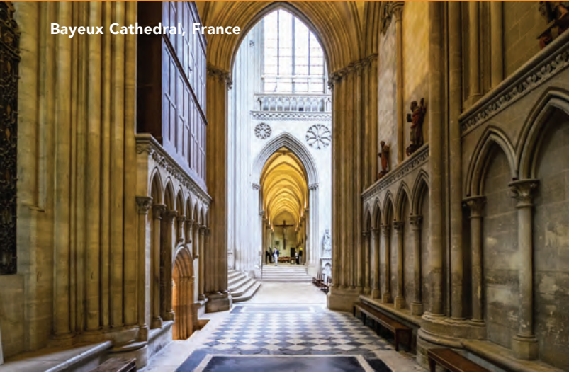
Bayeux Cathedral, France