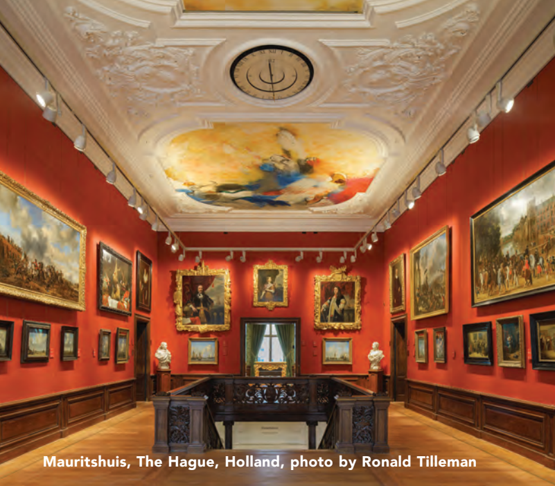
Mauritshuis, The Hague, Holland