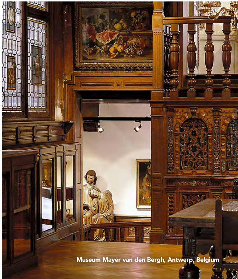
Museum Mayer van den Bergh, Antwerp, Belgium

Step ashore for a guided tour of Dordrecht's historic harbors, ancient warehouses, and busy merchant streets, as well as a historic city center that is home to about 1,000 monuments. Continue to Antwerp, a city renowned for its medieval and modern architecture and impressive art collections. Following lunch, see Antwerp's 16th-century Cathedral of Our Lady, where Rubens's famous Descent from the Cross is on display. Then admire the treasures of the Museum Mayer van den Bergh, whose collection includes Pieter Bruegel the Elder's Mad Meg . Dinner is at leisure. B,L