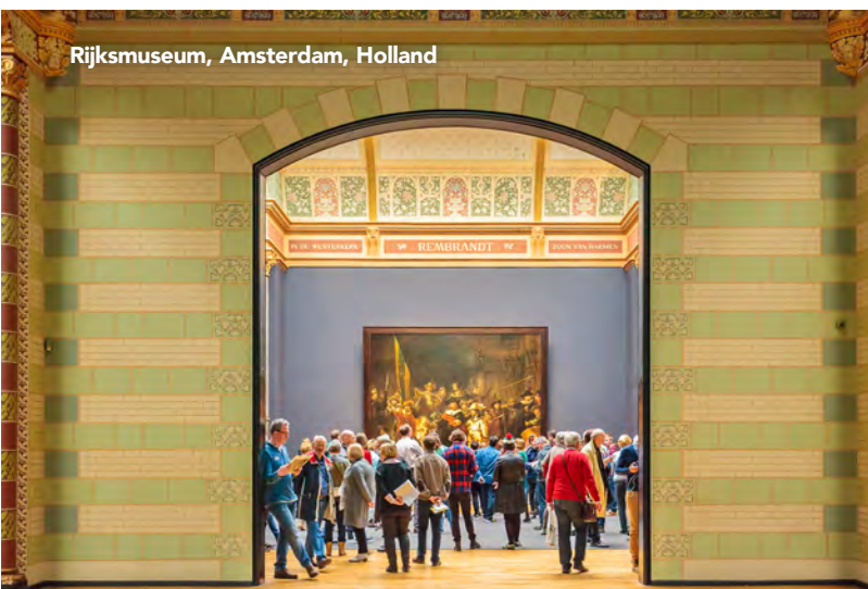
Rijksmuseum, Amsterdam, Holland

Arrive in Amsterdam and transfer for a canal cruise with lunch on board. Then visit Amsterdam's Rijksmuseum, the State Treasury of Dutch art, and marvel at works by Rembrandt, including the world-famous The Night Watch , as well as Vermeer, Frans Hals, and other masters. Afterwards, embark Magnifique III and enjoy a welcome dinner as we cruise to Vianen. L,D