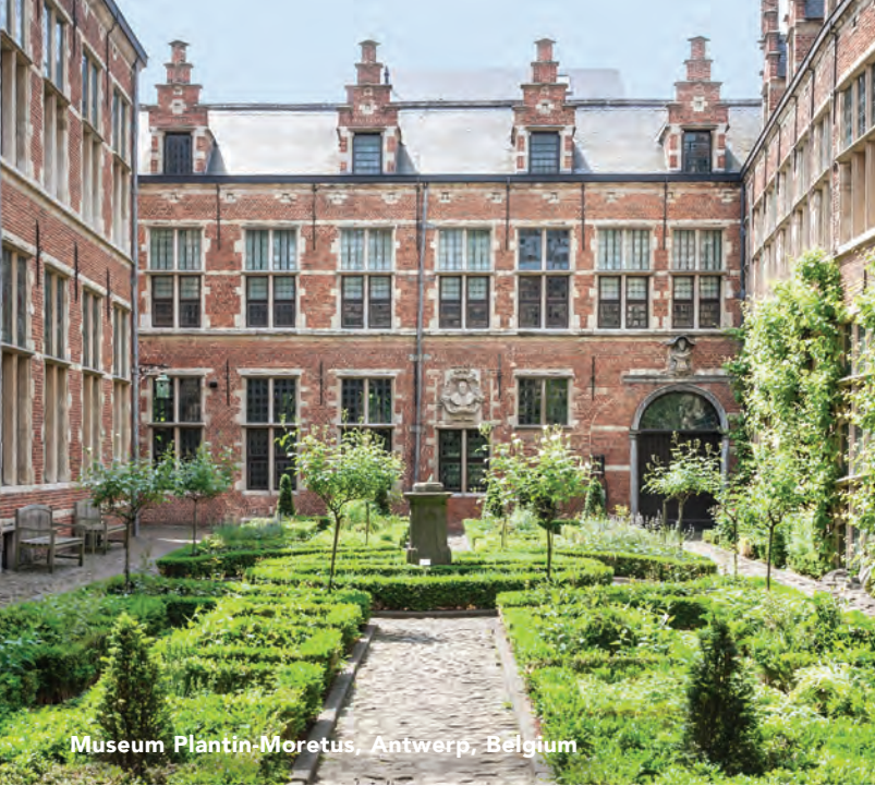
Museum Plantin-Moretus, Antwerp, Belgium