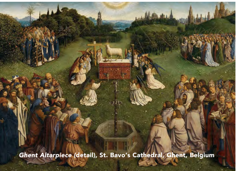
Ghent Altarpiece (detail), St. Bavo's Cathedral, Ghent, Belgium

In the morning, cruise or bike to Ghent, one of Europe's best-kept secrets. After lunch, enjoy a tour through the city's medieval center, including the magnificent St. Bavo's Cathedral, in use for more than 1,000 years. View its greatest treasure, the restored 15th-century Adoration of the Mystic Lamb (Ghent Altarpiece) by the Van Eyck brothers, known as "history's most stolen artwork," now returned to its rightful home. B,L,D